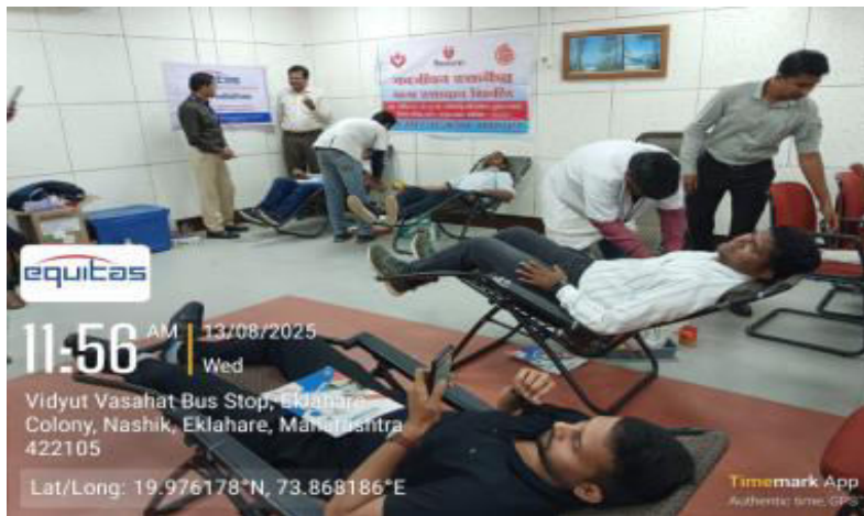
Blood Donation Camp @ Nashik