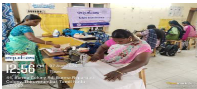
Tailoring @ Trichy