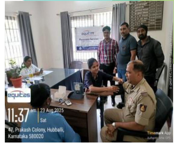
Multi specialty camp for Police personnel @ Hubli