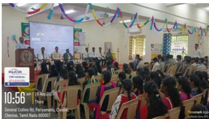
Cancer Awareness Program @Chennai