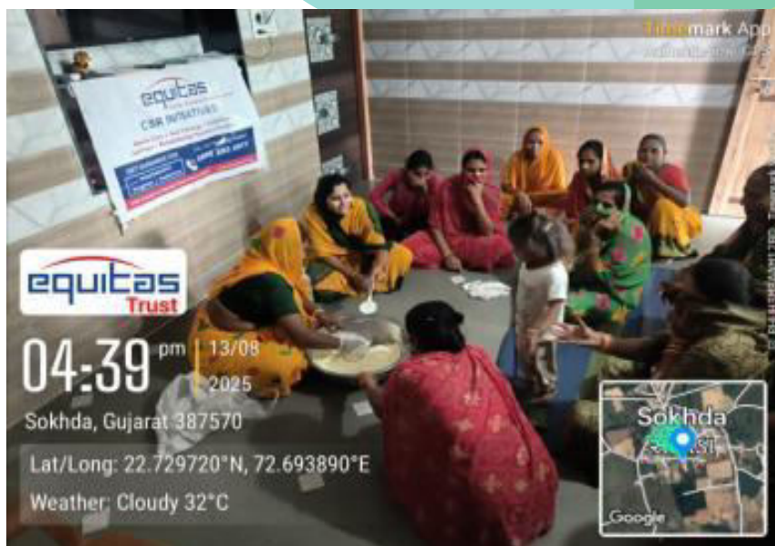
Washing Powder making @ Ahmedabad

Women Empowerment Providing skill development training to women from economically disadvantaged backgrounds empowers them to generate income, either as their primary source or as a supplementary income. By producing various items, these women not only fulfilled their household needs more affordably but also potentially create a profitable business by selling their creations. In this context, various Skill Development Training programs are being conducted by Equitas trust across India.