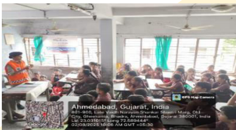
CPR Cardio-Pulmonary Resuscitation Training to school children @ Ahmedabad