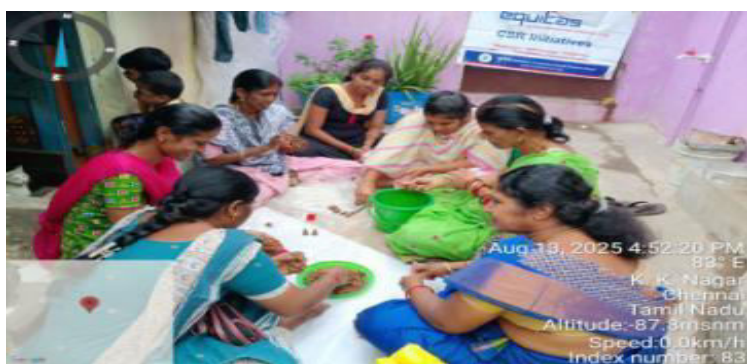
Agarbatti making @ Chennai

Women Empowerment Providing skill development training to women from economically disadvantaged backgrounds empowers them to generate income, either as their primary source or as a supplementary income. By producing various items, these women not only fulfilled their household needs more affordably but also potentially create a profitable business by selling their creations. In this context, various Skill Development Training programs are being conducted by Equitas trust across India.