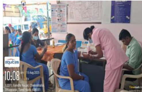
Organized health screening camp exclusively for sanitary workers @ Erode