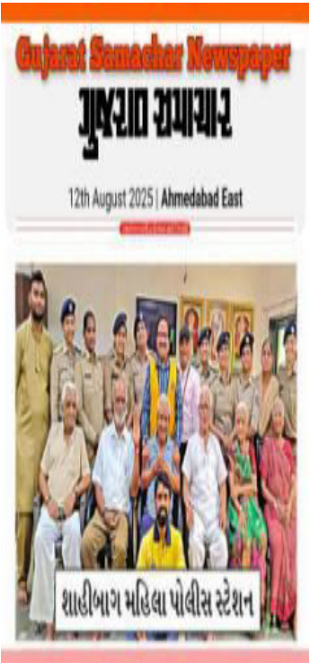
Raksha Bandhan celebration at Manilal Gandhi Vanprasthan Old Age Home