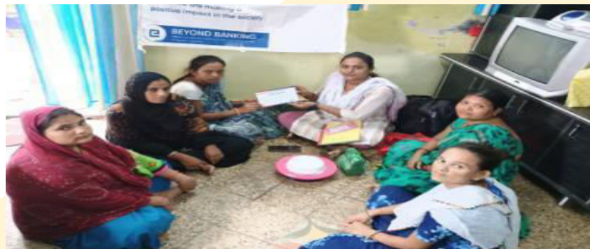
Cake Making @ Aurangabad