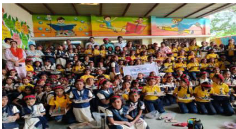
Eco-Friendly Ganesh idol making training to school children @ Pune