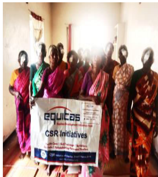
18 Beneficiaries underwent Cataract surgery @ Trichy Amount Saved: Rs54000/-