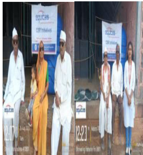
5 Beneficiaries underwent Cataract surgery@Pune Amount Saved : Rs.55000/-