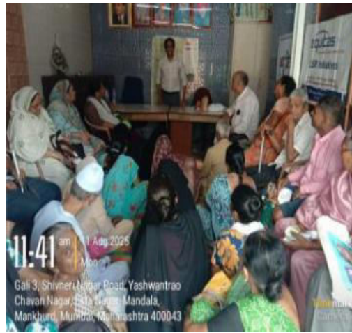
Cancer screening camp @Nashik