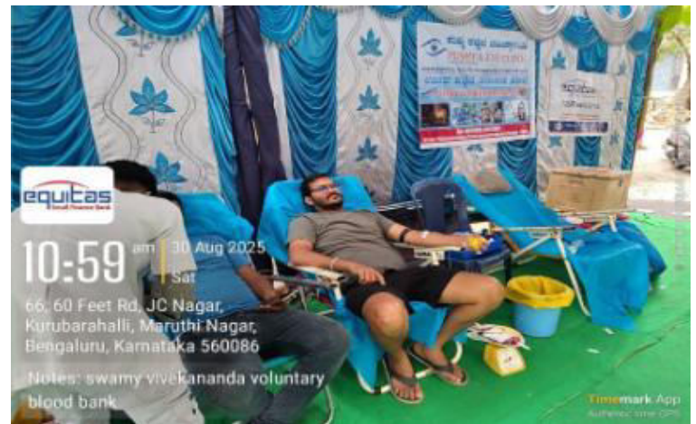
Blood Donation Camp @ Bangalore

TOTAL UNITS OF BLOOD COLLECTED : 13 UNITS