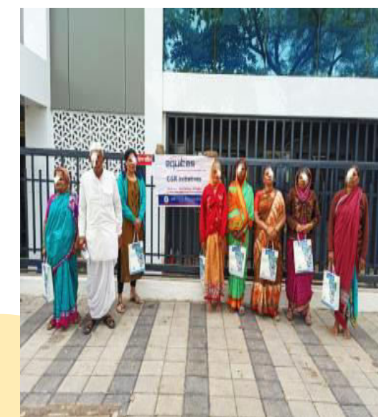
8 Beneficiaries underwent Cataract surgery @ Nashik Amount Saved : Rs. 80000/-