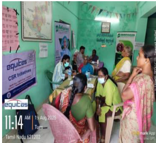
Urology & Gynecology camp @ Tiruchirappalli