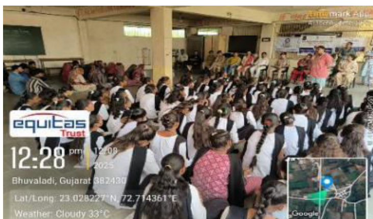
Cyber security awareness program @ Gujarat