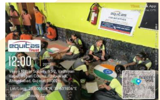
Conducted Rangoli Competition @ Ahmedabad