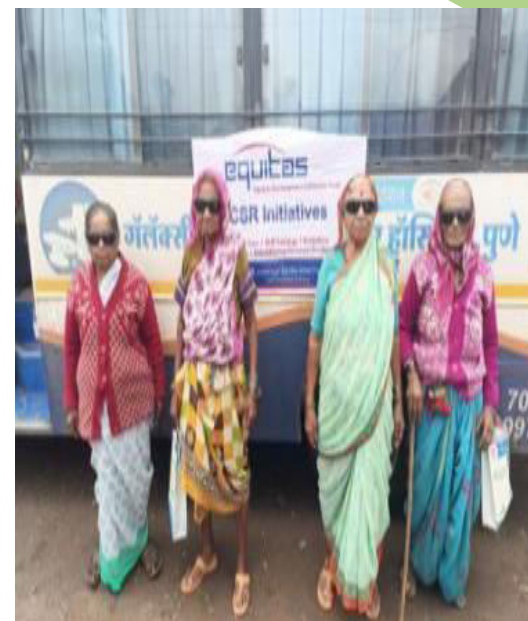
4 Beneficiaries underwent Cataract surgery @ Nashik Amount Saved : Rs. 40000/-