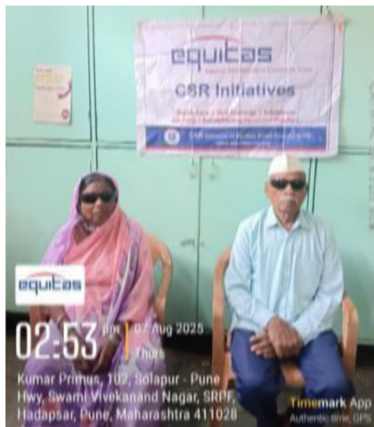
3 Beneficiaries underwent Cataract surgery @Pune Amount Saved : Rs.33000/-