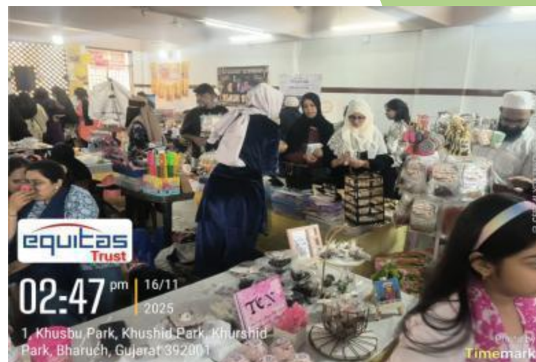
Organized exhibition @ Ahmedabad No of stalls :39 Sale value: ₹ 138079