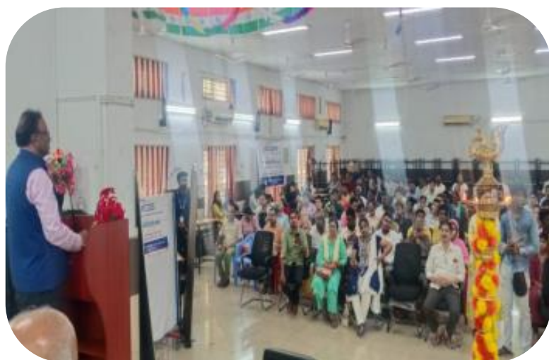
Mega Job fair for PWD @Chennai

No of Shortlisted : 1976 (Male : 1232 Female : 744)