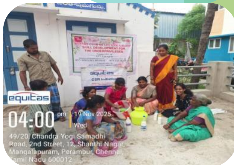
Chemical making @ Chennai

Women Empowerment Providing skill development training to women from economically disadvantaged backgrounds empowers them to generate income, either as their primary source or as a supplementary income. By producing various items, these women not only fulfill their household needs more affordably but also potentially create a profitable business by selling their creations. In this context, various Skill Development Training programs are being conducted by Equitas trust across India