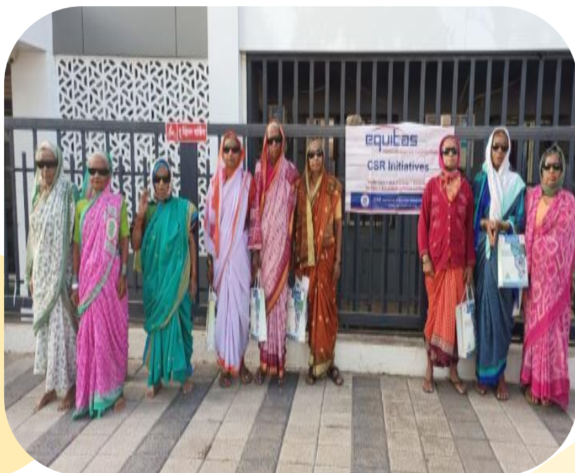
9 Beneficiaries underwent Cataract surgery @ Nashik Amount saved : ₹90000