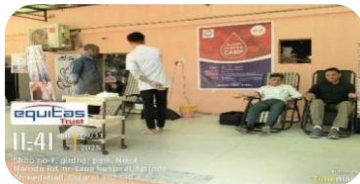
Blood Donation Camp @ Ahmedabad