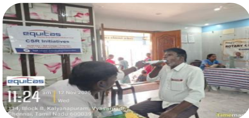
Pulmonary Camp @ Chennai