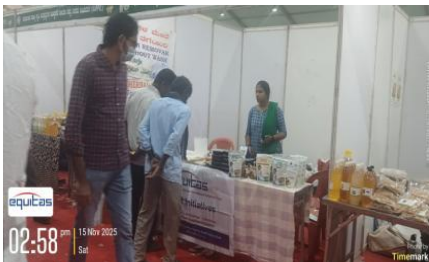
Organized exhibition @ Bengaluru No of stalls :5 Sale value: ₹ 76000