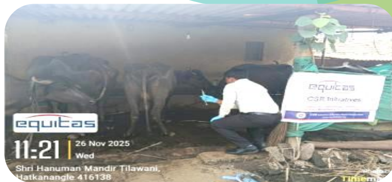
Veterinary camp @ Kolhapur