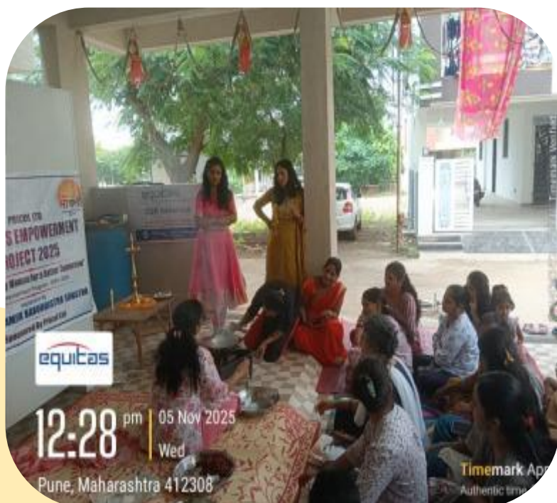
Masala Making @ Pune

Women Empowerment Providing skill development training to women from economically disadvantaged backgrounds empowers them to generate income, either as their primary source or as a supplementary income. By producing various items, these women not only fulfill their household needs more affordably but also potentially create a profitable business by selling their creations. In this context, various Skill Development Training programs are being conducted by Equitas trust across India