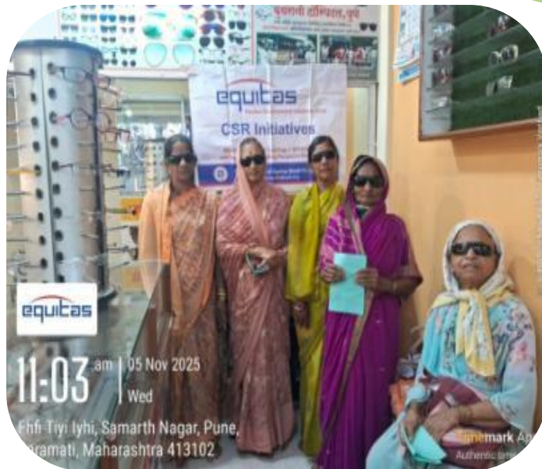
5 Beneficiaries underwent Cataract surgery @ Pune Amount saved : ₹25000