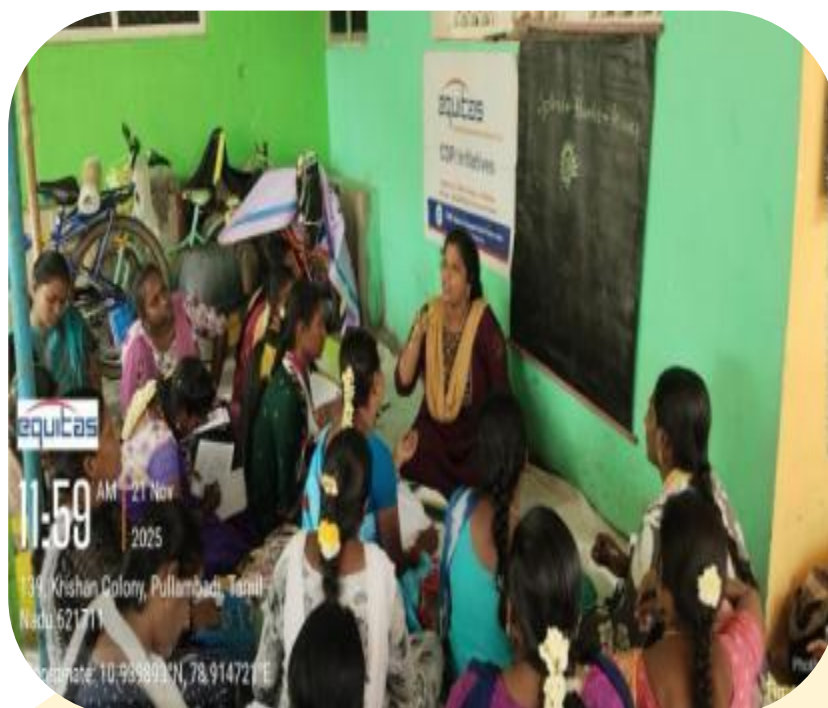
Mehandi class @ Trichy