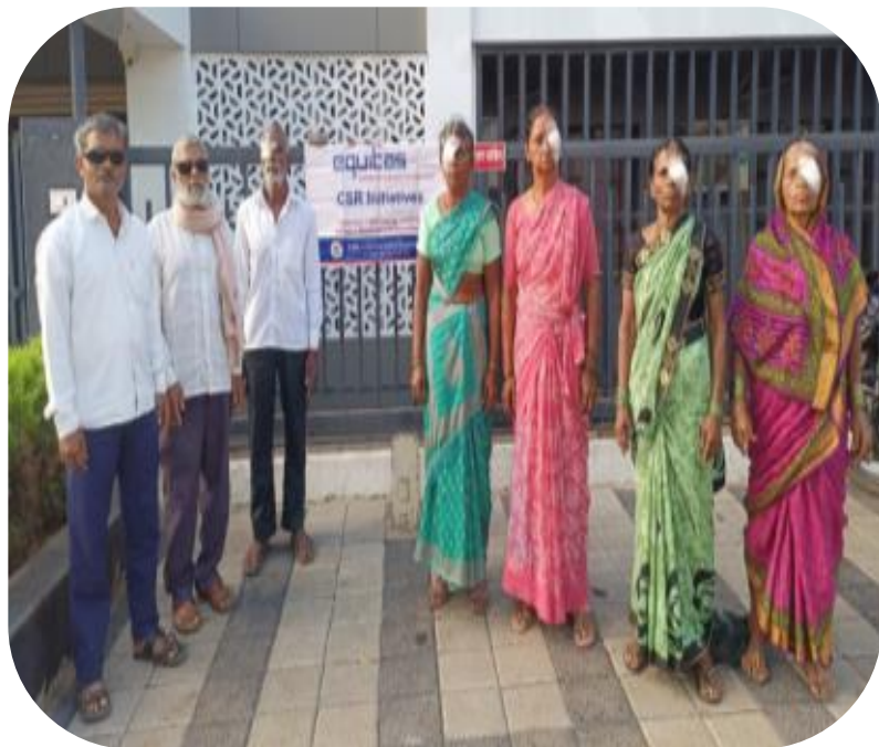
7 Beneficiaries underwent Cataract surgery @ Nashik Amount saved : ₹70000