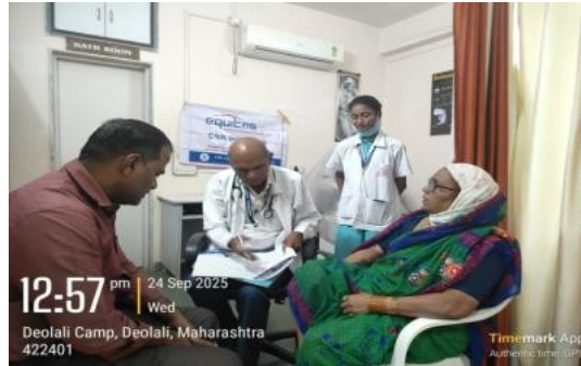
Bone Density Check Up Camp @ Nashik