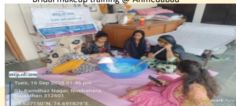
Detergent Powder making @ Udaipur