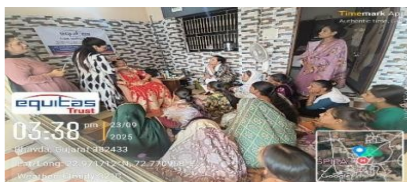
Bridal makeup training @ Ahmedabad