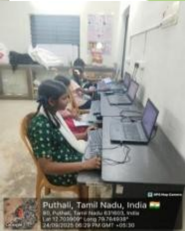
CLASS WISE STUDENTS ATTENDING TUITION AT PUTHALI