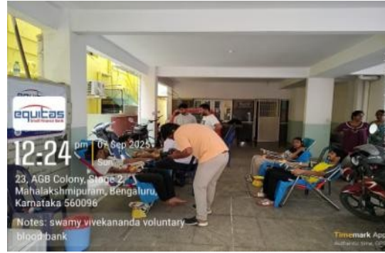
Blood Donation Camp @ Bangalore