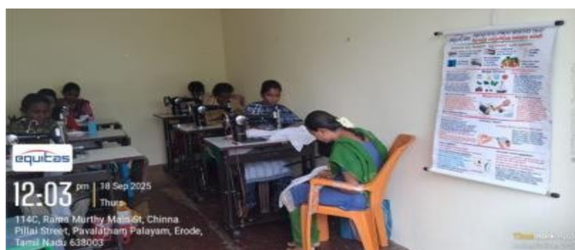
Tailoring @ Erode

Providing skill development training to women from economically disadvantaged backgrounds empowers them to generate income, either as their primary source or as a supplementary income. By producing various items, these women not only fulfilled their household needs more affordably but also potentially create a profitable business by selling their creations. In this context, various Skill Development Training programs are being conducted by Equitas trust across India