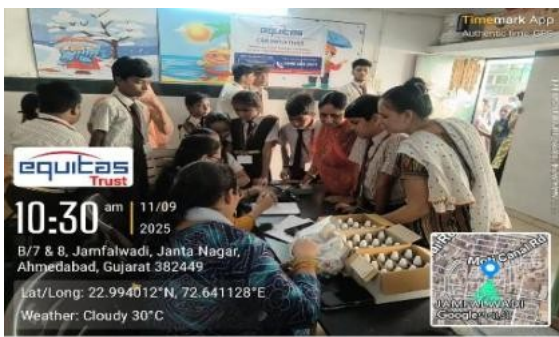
Ayurvedic health camp @ Ahmedabad