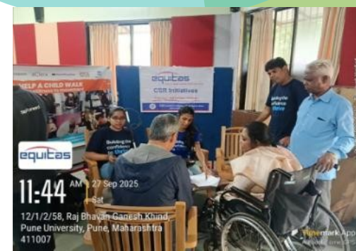
Artificial Limb Measurement Camp @ Pune