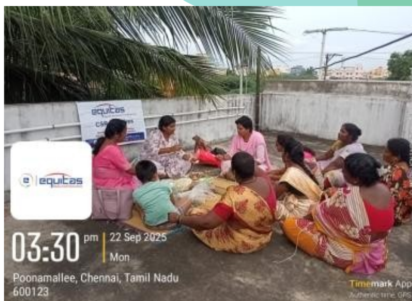
Artificial Floral garland making @ Chennai