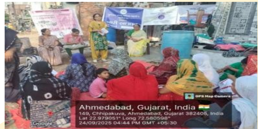
Organized Breast cancer awareness program @ Ahmedabad