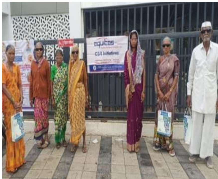
7 Beneficiaries underwent Cataract surgery @ Nashik Amount saved : ₹70000