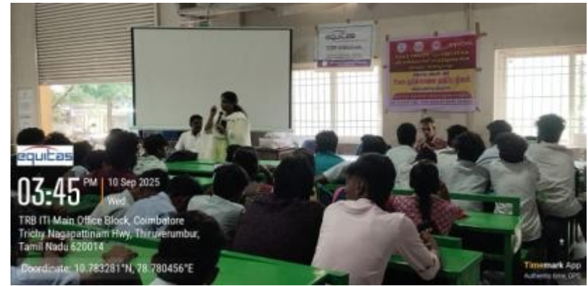
To mark World Suicide Prevention Day, an awareness session was held in Trichy focusing on suicide prevention, recognizing warning signs, managing stress, addressing substance use, and promoting mental health care and treatment options