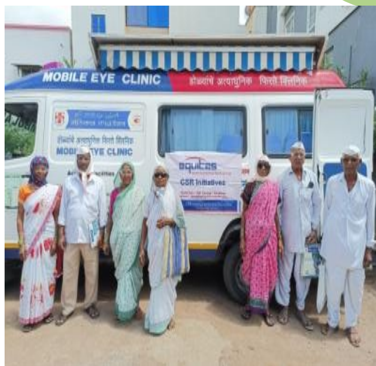
7 Beneficiaries underwent Cataract surgery @ Nashik Amount saved : ₹70000