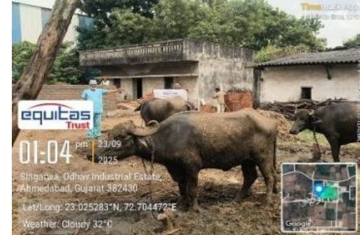
Veterinary camp @ Ahmedabad