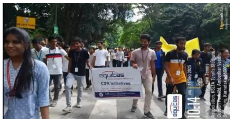
Participated in the Walkathon, "Walk to Empower" organised by CRY @ Cubbon Park, Bangalore