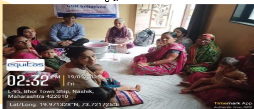
Liquid soap making @ Nashik