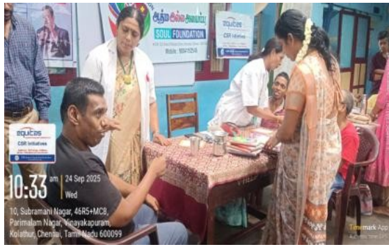
Health camp for PWD @ Chennai