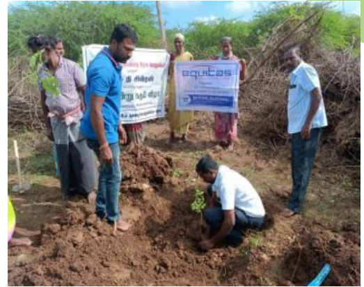
Tree plantation drive at Madurai , planted 500 Saplings