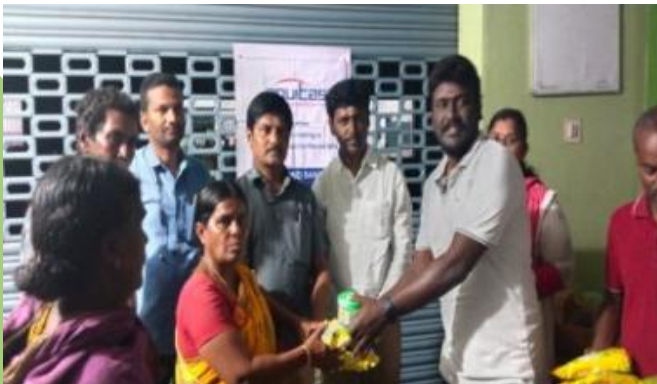
Micronutrients added Salt Distributed for 750 families at Erode