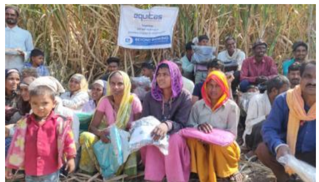
Donated Clothes worth of Rs 15000 to 150 Sugar Cane Workers.- Maharashtra