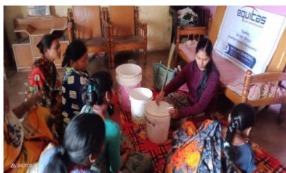
Chemical Preparation Training Nagpur

No of Women Entrepreneurs attended EGK Skill Trainings