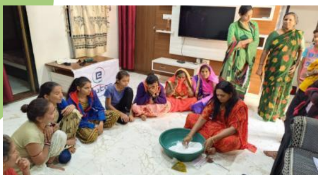
Chemical Preparation Training - Gujarat