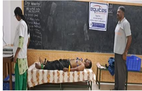
Cardiac Camp - Salem