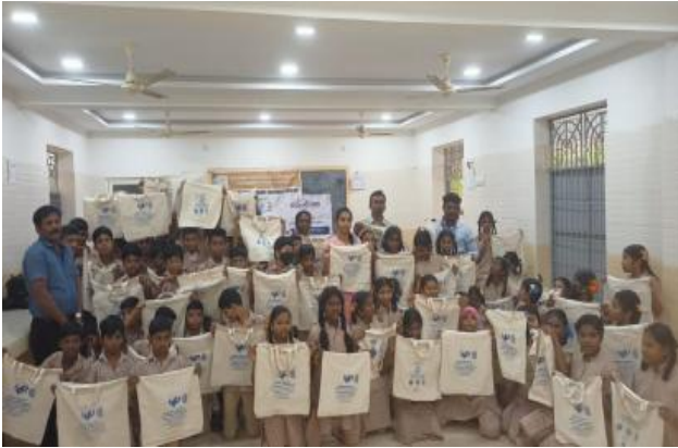
Environment Protection Awareness Campaign – “ Say no to Single Use Plastics “ conducted at Chennai. Facilitated Utkarsh Foundation for distributing 300 Cloth Bags to School Students Free of Cost .