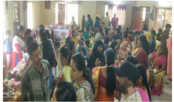
Stall Activity @ Bangalore. No Of stall 2 Sale Value : Rs.9500