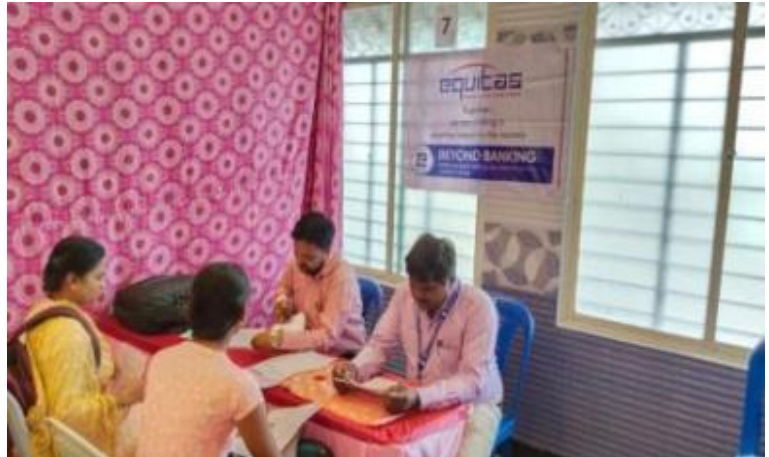
Job fair - Chitradurga.