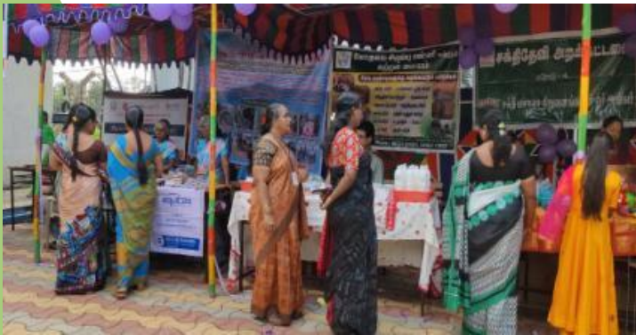
Stall Activities ( Disabled day) Function Erode. No Of Stalls : 5 Sale value : Rs.46,750/-