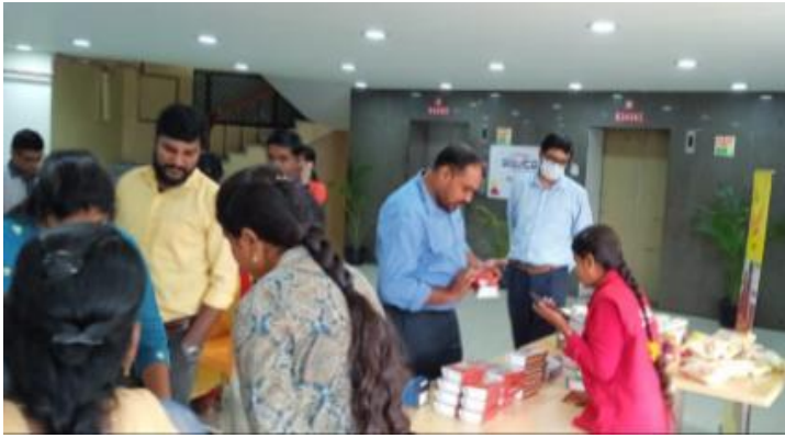
X-MAS with Santa ,stall activity @ HO. No Of Stalls : 4 ,Sale Value Rs.40,835/-