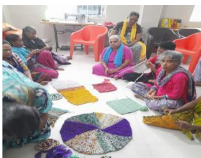
Door Mat making Training - Chennai