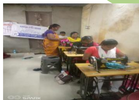
Tailoring Training - Tirunelveli