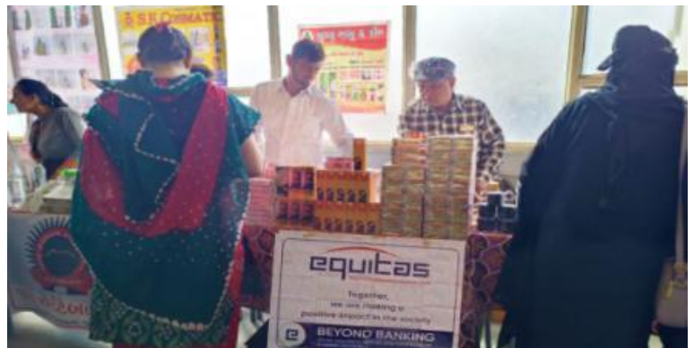
Beauty product stall activity Gujarat. No Of Stalls : 2 Sale value : Rs.12000/-