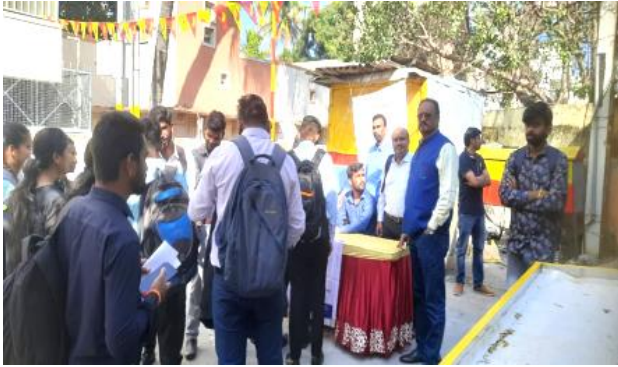
Job Fair - Bangalore