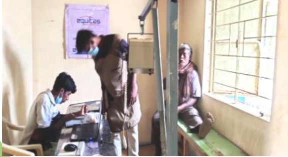
Ortho Camp - Erode