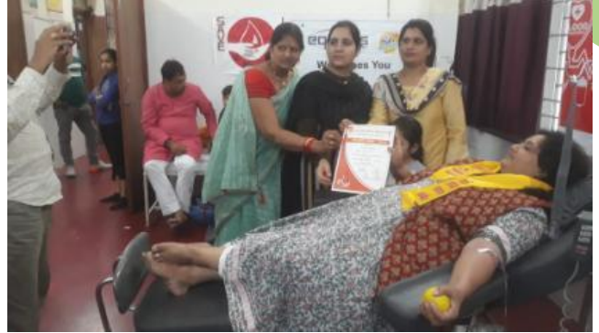
Blood Donation camp - Indore. No Of Unit Donated : 75