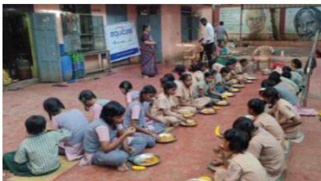
Organized Breakfast to 40 children at Annai children home.