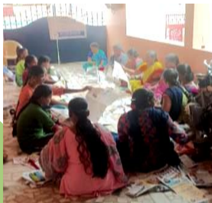
Blouse Cutting - Trichy