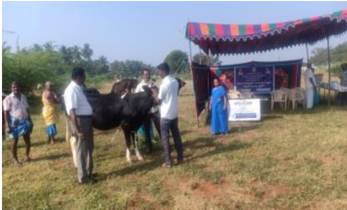
Veterinary camp - Coimbatore (Artificial Insemination & Measles Vaccine)