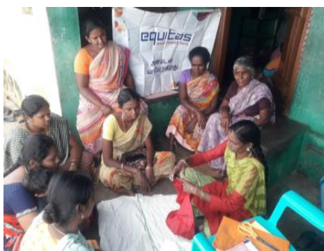
Blouse Cutting - Dindukkal