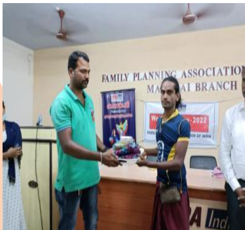
Together with FPAI , Distributed blanket worth of Rs 25000 & groceries to 45 Aids patient - Madurai