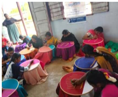
Embroidery Training Salem