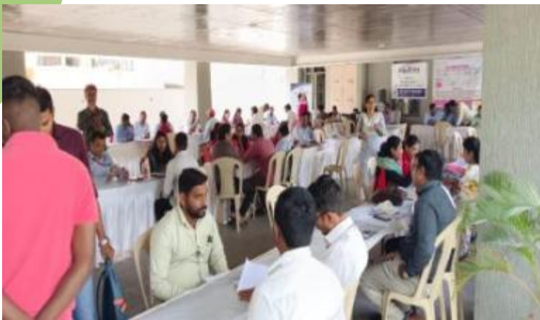
Job Fair - Kolhapur