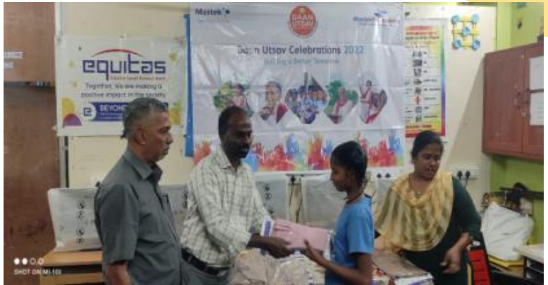
Facilitated Mastek Foundation for giving School Uniforms to 13 school students - Chennai