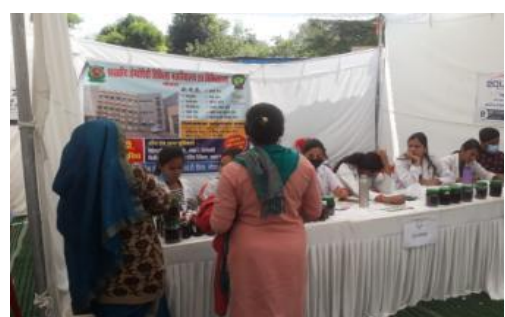
Homeopathy Camp - Indore