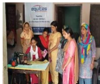
Tailoring Training Haryana