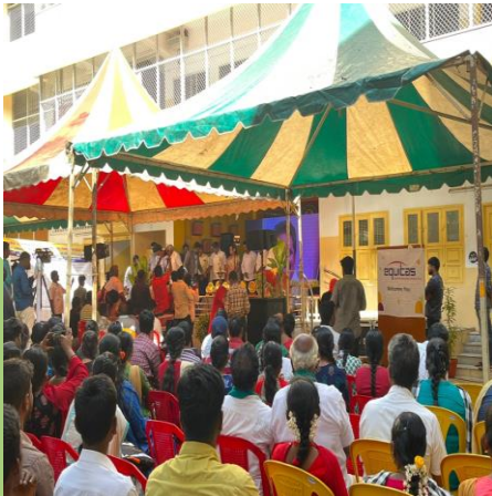
Job Fair - Kanchipuram