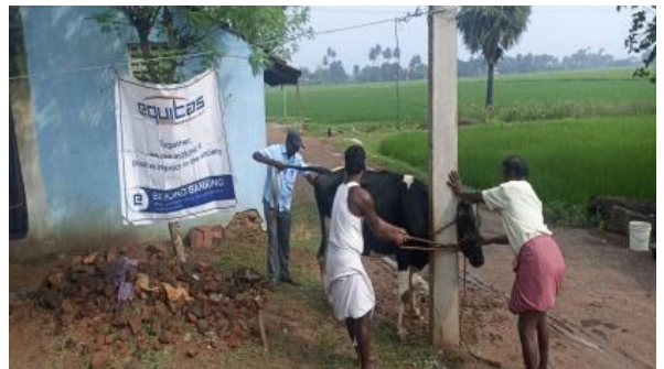
Veterinary camp @ Ammapettai (Deworming & Measles Vaccine)