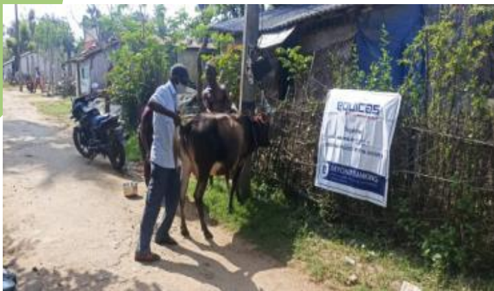
Veterinary camp - Pattukottai (Artificial Insemination & Measles Vaccine)