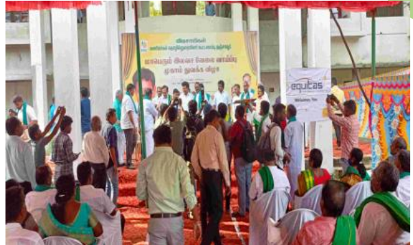
Job Fair - Thanjavur