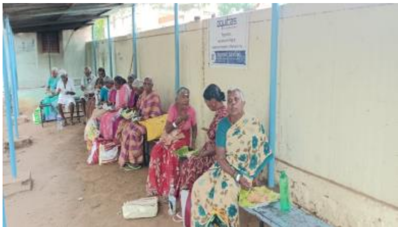
Provided Lunch for 35 distitue's elders at Kiruba Old Age Home.