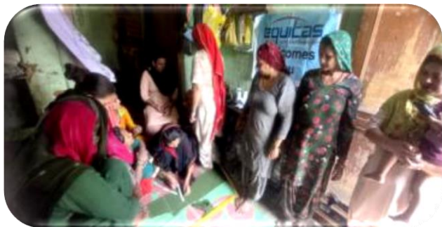
TAILORING - HARYANA