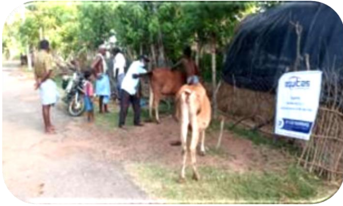
Veterinary camp Kumbakonam