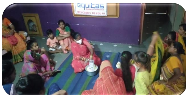
WASHING POWDER TRAINING - AHMEDABAD