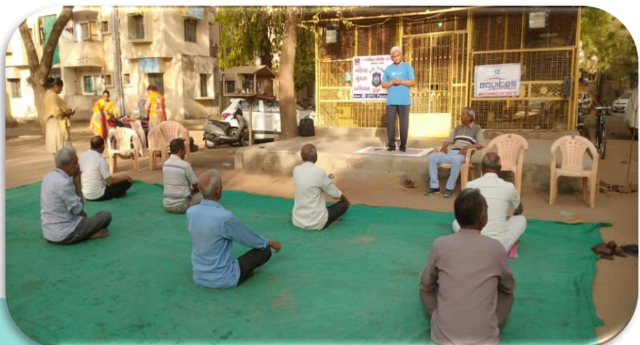
Yoga activity Ahmedabad