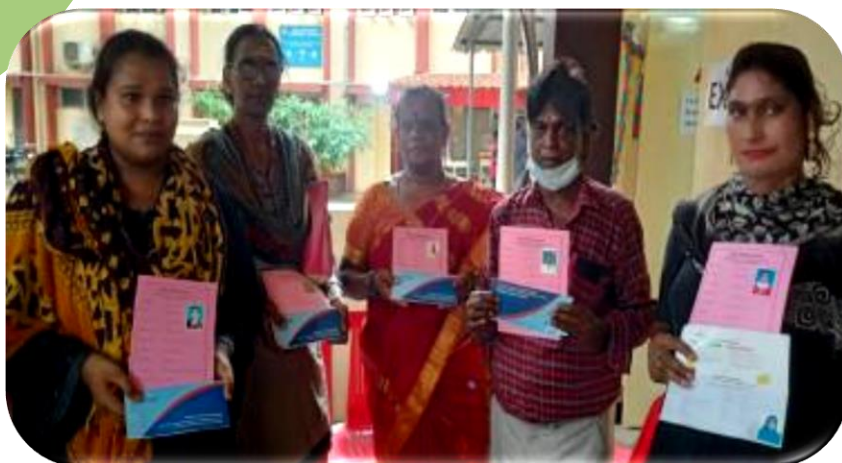
Provided Corona Sumrakashan loan for 15 member's which includes 5 Transgenders