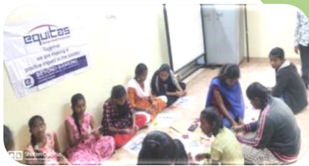
FABRIC DESIGNING TRAINING - BANGALORE