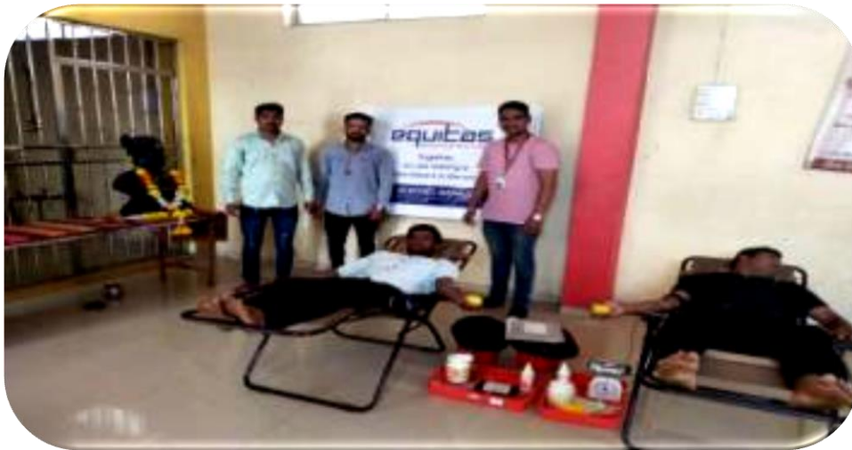
Blood Donation Camp Maharastra No of Units Donated: 108 units

Facilitated Freedom from Hidden Hunger, A project of Sundar Serendipity Foundation to distribute Micro Nutrients fortified salt packets (1350 Kilograms) to 225 women, free of cost at Kannagi Nagar. Approx value is Rs.40,500