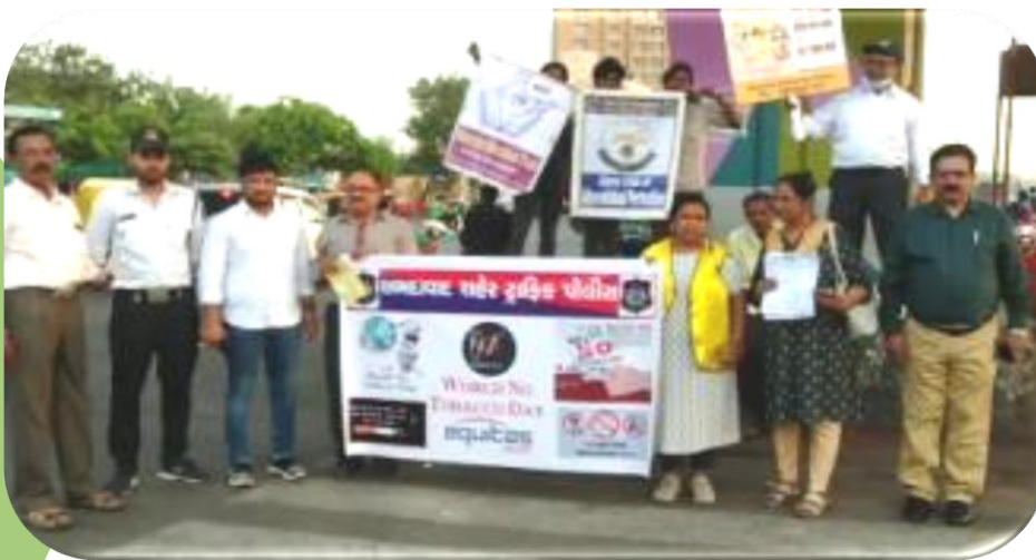
Conducted Tobacco day Awareness with Traffic Police & Lion's Club team at CTM cross road, Ahmedabad