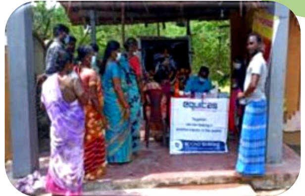
Diabetic Screening Camp Ammappettai