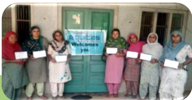
TAILORING TRAINING - PUNJAB