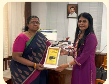
TMT.M.LAKSHMI, IAS COMMISSIONER FOR WELFARE OF DIFFERENTLY ABLED, GOVT. OF TAMIL NADU