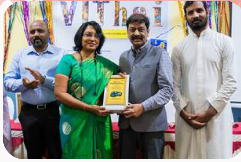
RTN.D.SURESH JAIN, DISTRICT GOVERNOR, ROTARY INTERNATIONAL - 26-27