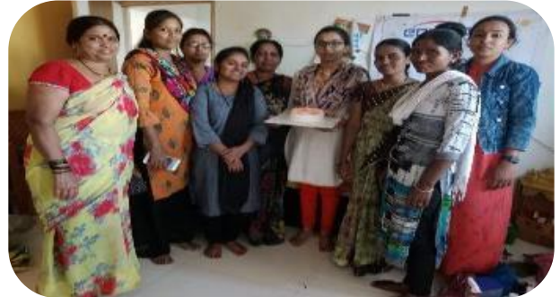
Cake Making Training - Indore

No of Women attended EGK Skill Trainings