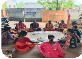
Blouse Cutting Training - Trichy