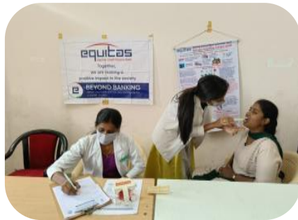
Dental Camp - Villupuram