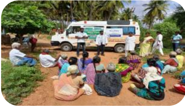
Conducted AIDS day awareness programme in Madurai Area.