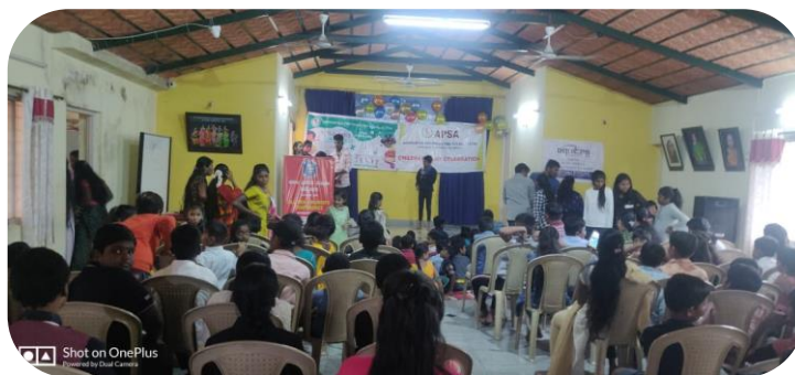
Organized Children's Day celebration at Bangalore together with NGO, APSA .