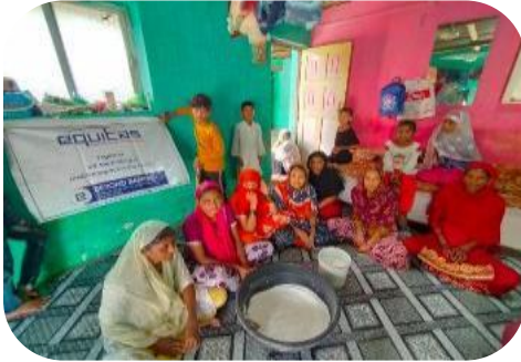
Washing Powder Making Training - Nashik