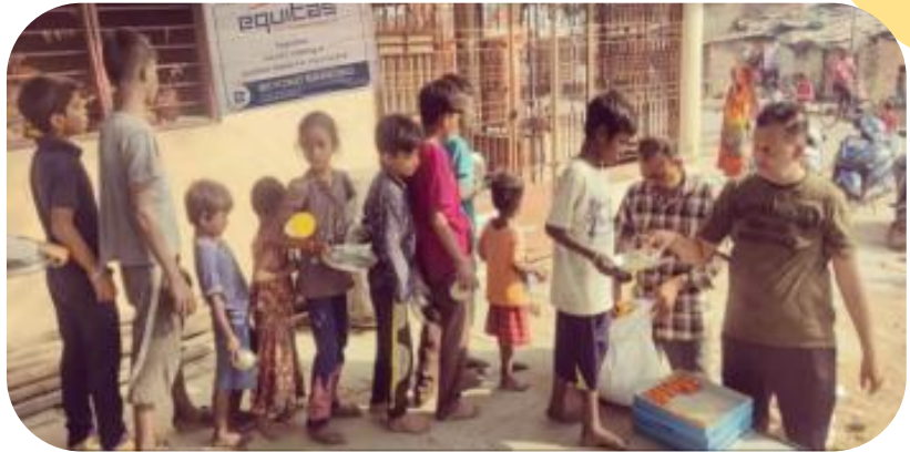
Provided Lunch to Seva Groups Children - Gujarat