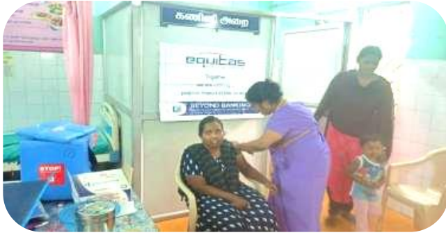
Vaccination Camp - Chennai