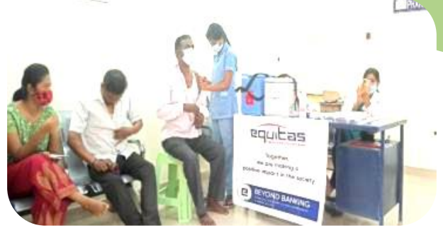
Vaccination Camp - Trichy

Total no of Vaccination Camp Beneficiaries