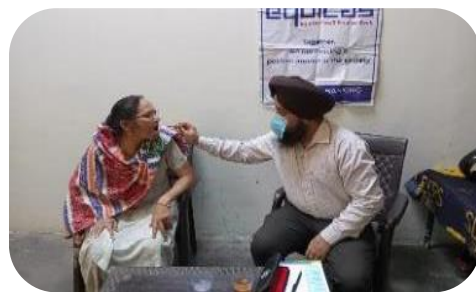
Dental Camp - Madhya Pradesh