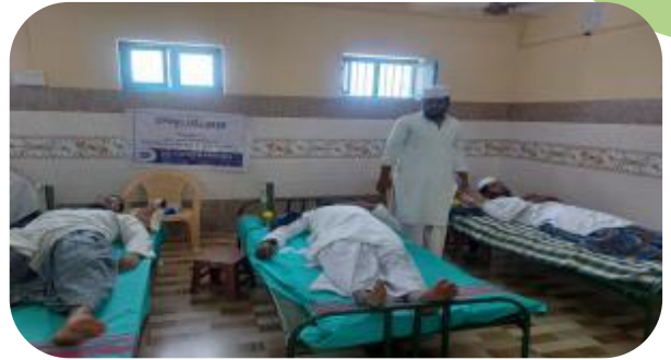
Blood Donation Camp at Tirunelveli No of Units Donated : 32