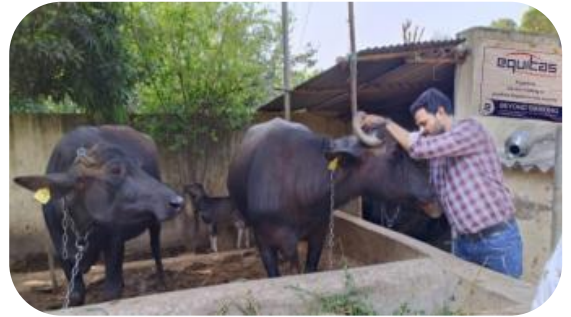
Veterinary Camp - Gujarat (Deworming)