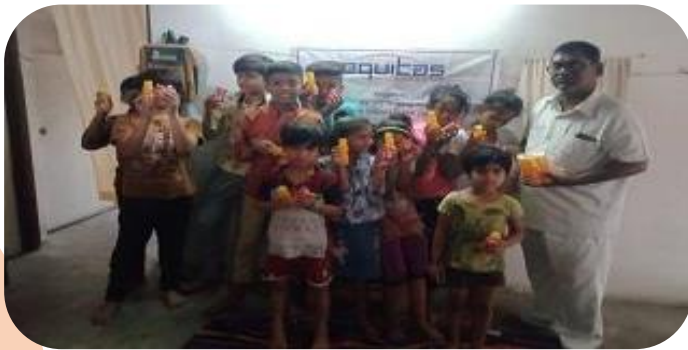
Provided Snacks to Mothers Child Age Home - Raipur.