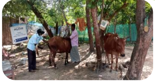
Veterinary Camp - Manargudi (Artificial Insemination & Measles Vaccine)