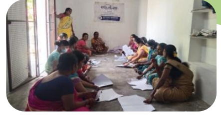
Blouse Cutting Training - Madurai