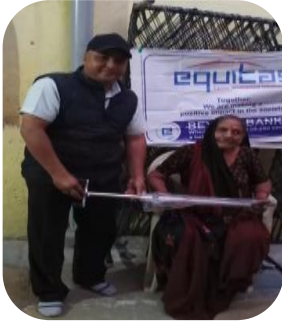
Distributed Crutches Worth of Rs1500 - Gujarat.