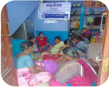
Blouse Cutting Training - Perambalur