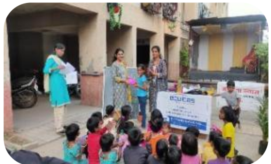
Children's Day Celebration - Pune