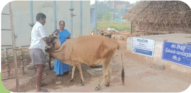
Veterinary Camp - Ariyalur (Deworming)