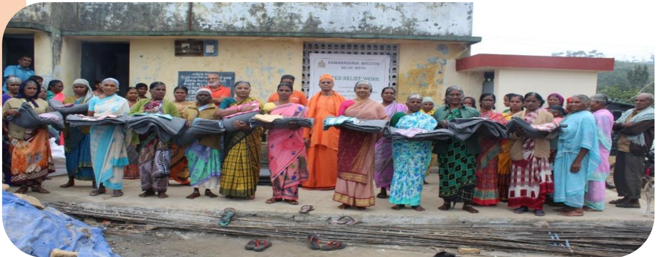
Facilitated Ramakrishna Mission Math ,Salem for distributing blankets Worth of rupees