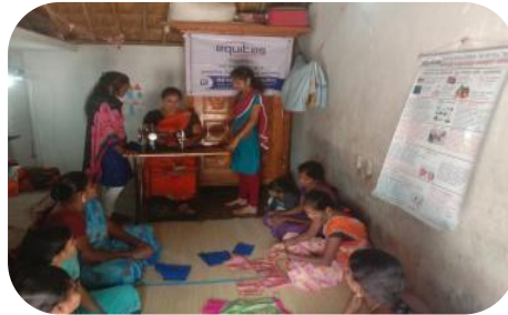
Chudidhar Cutting Training - Villupuram