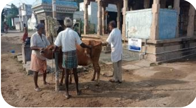
Veterinary Camp - Lalgudi (Artificial Insemination & Measles Vaccine)