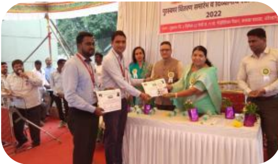
Paralympic Sports Association Kolhapur and Prahar Divyang Kranti Sanstha Maharashtra honored our Trust for service provided to persons with disabilities