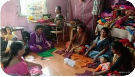
Blouse Cutting Training - Chennai