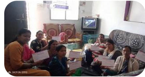
Blouse Cutting Training - Nagpur