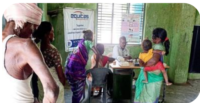
Diabetic Camp - Kumbakonam