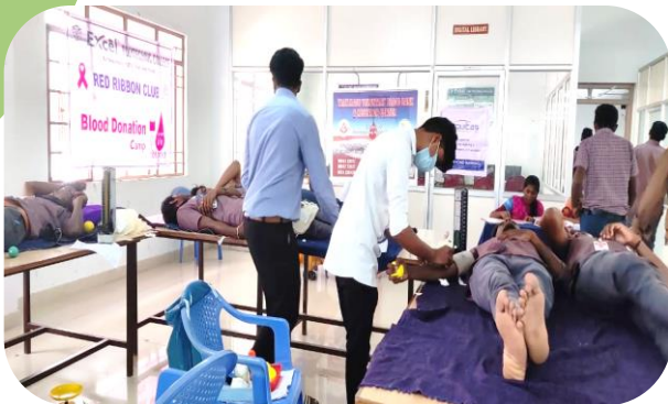
Blood Donation Camp - Erode No of Units Donated : 100