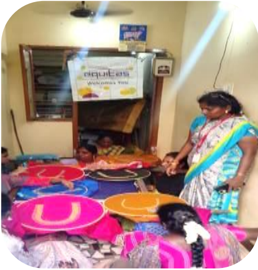
Aari Work Training - Chennai