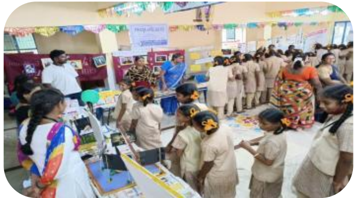
Conducted awareness program for school children in the eve of International Day of the Girl Child - Madurai