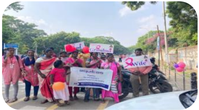
Cancer Awareness Walkathon with CAN STOP - Chennai