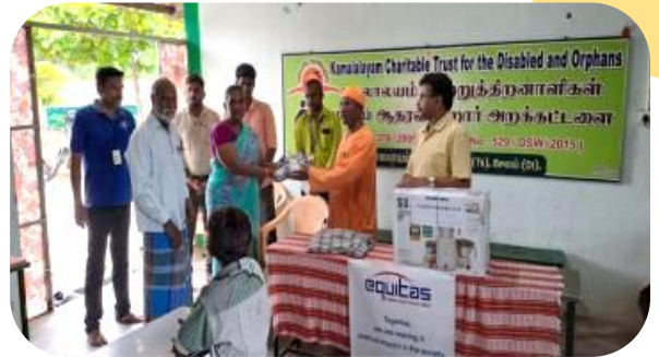
Distributed new clothes, sweets and provisions Worth of Rs.10000/- of to Leprosy Rehabilitation Centre at Thalaivasal, Attur.