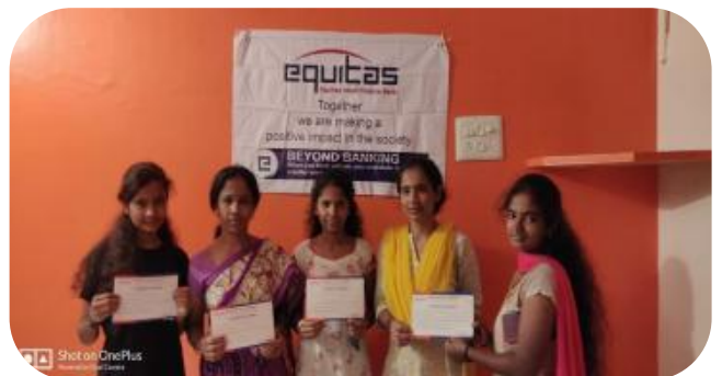
Blouse Cutting Training - Bangalore