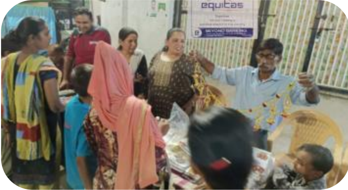
Organized Exhibition - Gujarat No of Stalls : 7, Sale Value Rs.9000/-