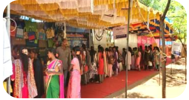
Organized Exhibition at Xavier's College, Tirunelveli No of Stalls :16, Sale Value Rs.98150