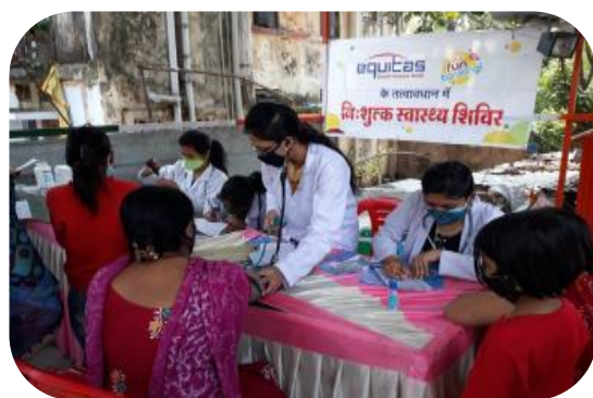
Homeopathy Camp - Indore