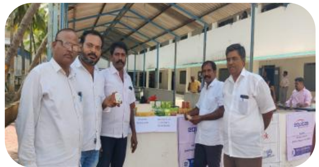
Organized Exhibition @ Anthiyur No of Stalls : 2, Sale Value Rs.7950/-