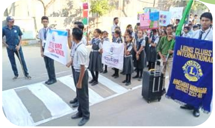
Organized Traffic Awareness March - Gujarat