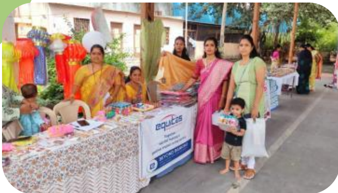
Organized Exhibition - Pune. No Of Stalls: 94, Sale Value Rs.277940/-