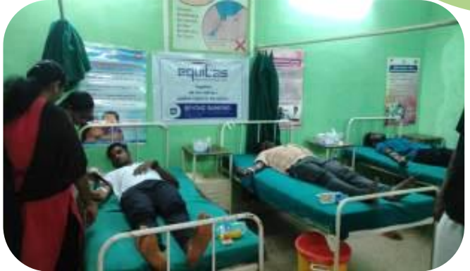
Blood Donation Camp - Dindugal No of Units Donated : 58