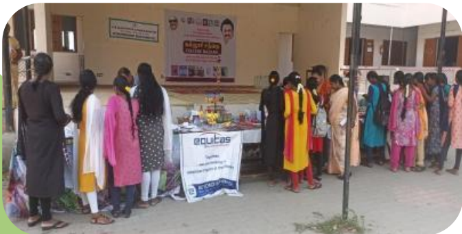
Organized Exhibition @ Nagapattinam No Of Stalls: 23, Sale Value Rs.87317/-