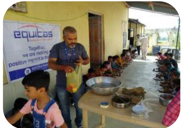
Distributed Fruits & biscuits Worth of Rs.1500 to the children of Jain Gurukul Orphanage - Nashik.