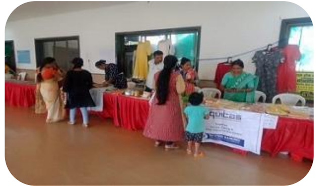
Organized Exhibition at Nagpur. No of Stalls : 21, Sale Value Rs.98000/-