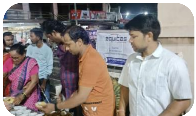
Provided Food Worth of Rs.2000 to pavement dwellers - Amaravathi.