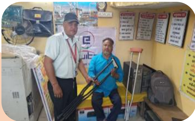
Distributed Crutches worth of Rs1500 - Gujarat.