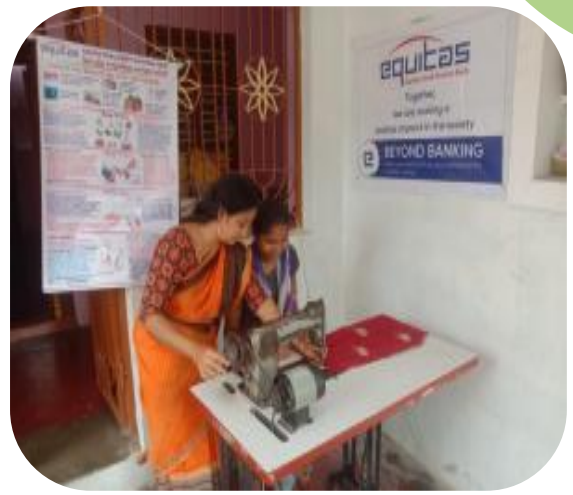
Blouse Cutting Training - Villupuram