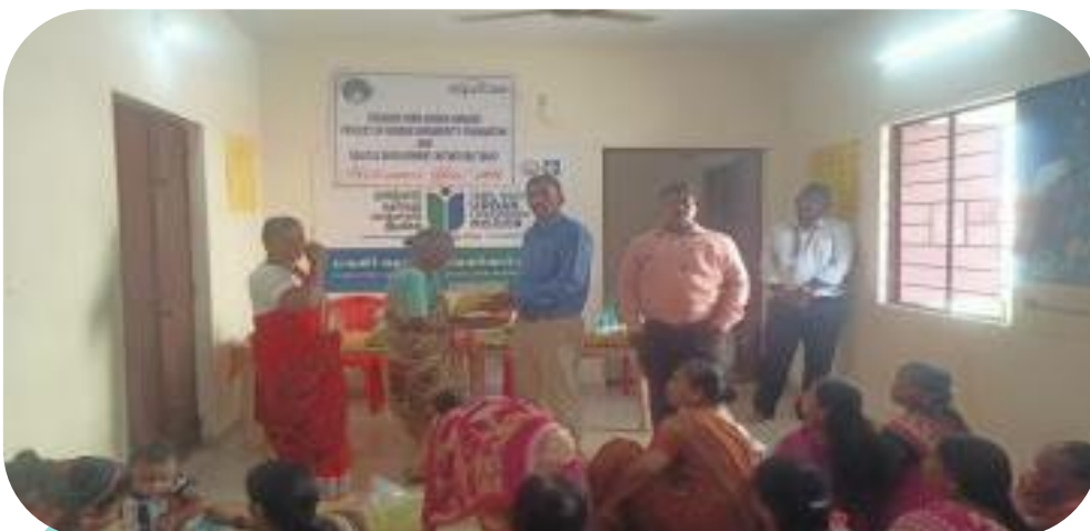
Distributed Sundar Health Salt to 400 families - Chennai