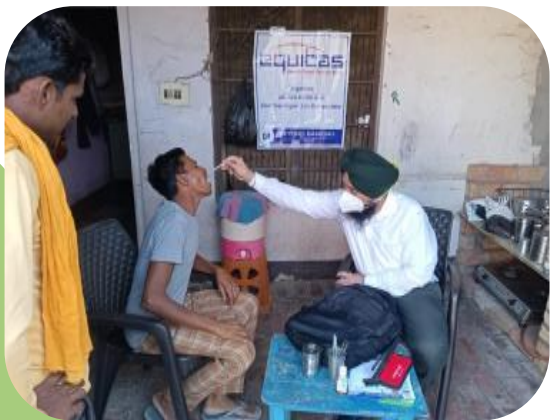
Dental Camp - Jodhpur