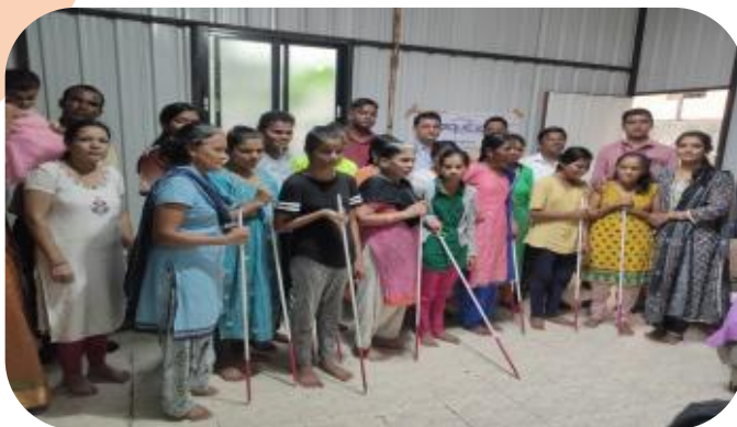
White Cane distributed for 30 Visually Impaired girls - Maai Baalbhaven, Pune Worth of Rs.5600/-