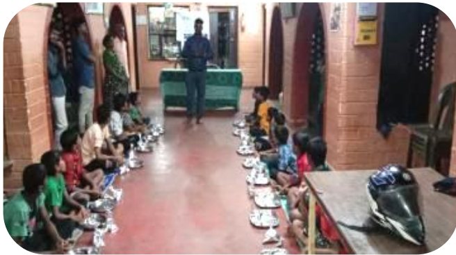
Provided Dinner for the 35 inmates of Jeeva Jothi Children Home - Chennai.