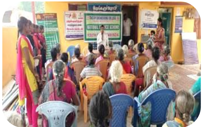
Cancer Awareness seminar - Trichy