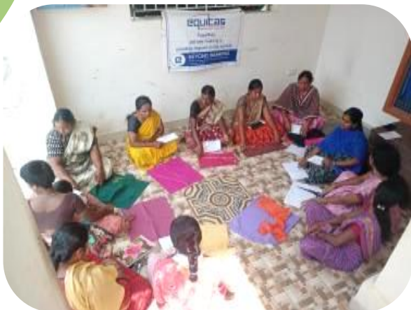
Blouse Cutting Training - Trichy