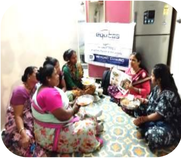
Masala Powder Making Training - Pune