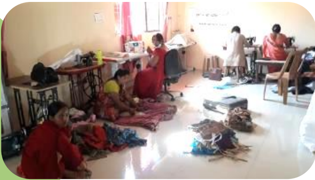
Blouse cutting Training - Indore