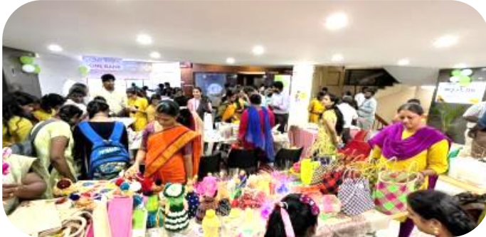
Organized Exhibition - " Diwali Dhamaka" - HO, Chennai No of Stalls : 20, Sale Value Rs.230859/-