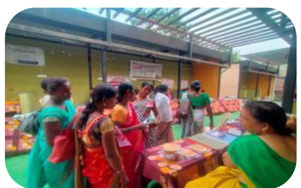
Organized Exhibition - Amaravathi, No of Stalls : 20, Sale Value Rs.60000/-