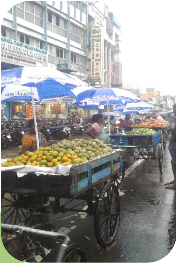
Provided Umbrella to Rehabilitated Pavement Dwellers - Chennai