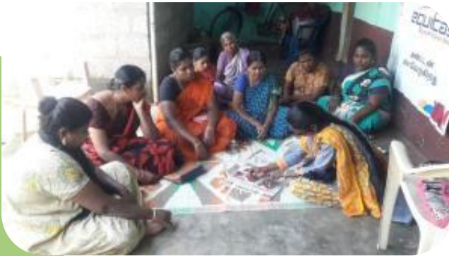
Blouse Cutting Training - Dindugal