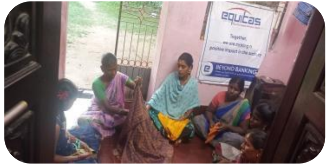
Chudidhar Cutting Training - Mannargudi