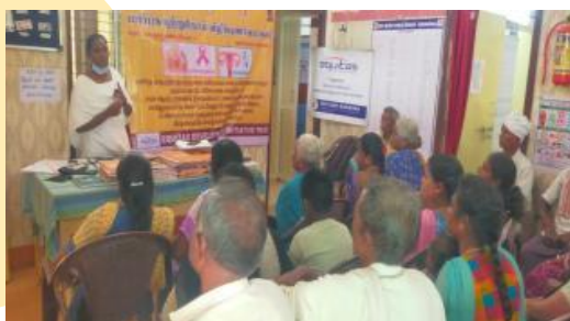
Cancer Awareness Program @ Pondicherry