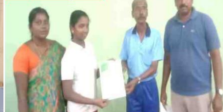
III Place, Table Tennis, Under 14