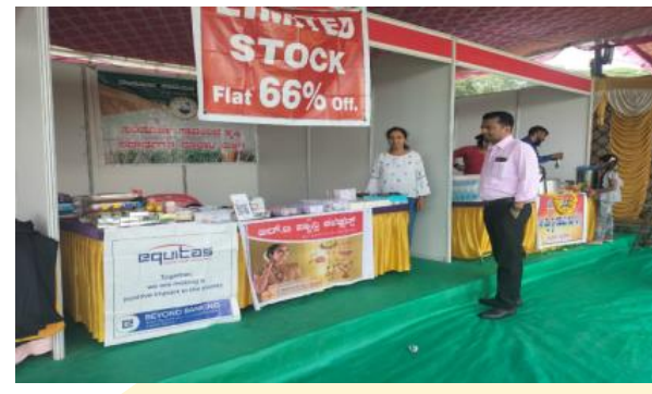
Organised Stalls at Mysore Dusshera festival. No of Stalls: 3 for 5 days, Total Sale Value : Rs.87,950

No . of Exhibitions Organized : 14 Total Sale Value Through Temporary Markets: 5,33,520