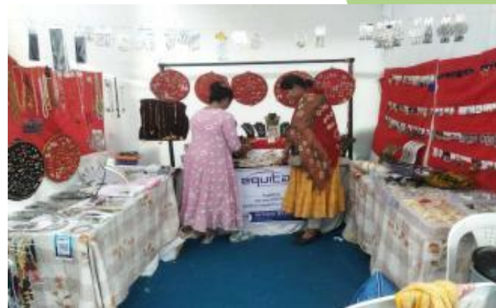
Diwali Exhibition @ Nagpur No. of Stalls: 18, Total Sale Value : Rs. 98,000