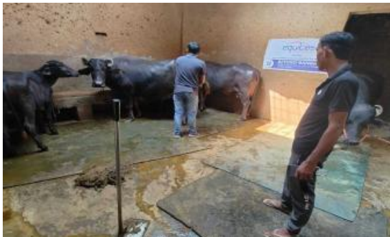
Veterinary Camp @ Haryana