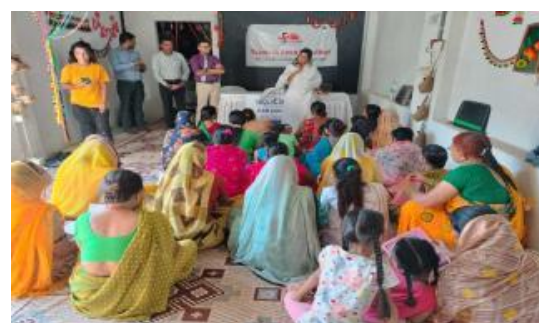
Breast Cancer Awareness Program @ Udaipur