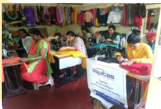
Tailoring Class @ Bangalore