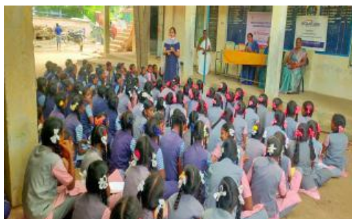
Menstrual hygiene awareness Program @ Pondicherry