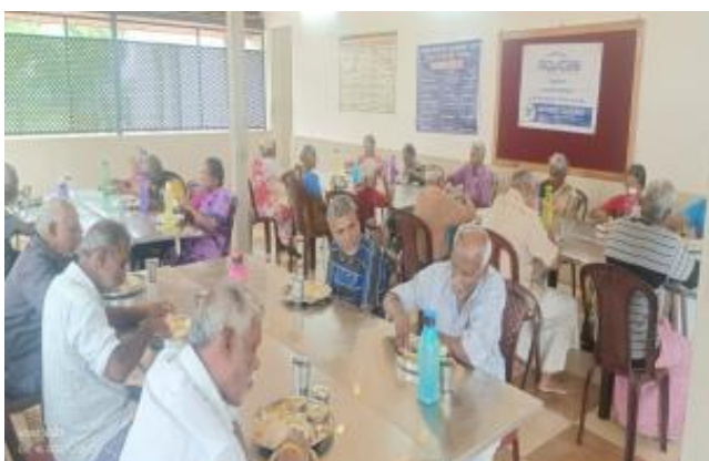
Provided morning breakfast to 30 Old aged people @ Dindugal