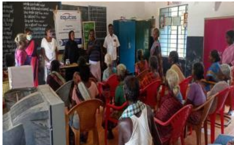
Cancer awareness Program @ Kumbakonam