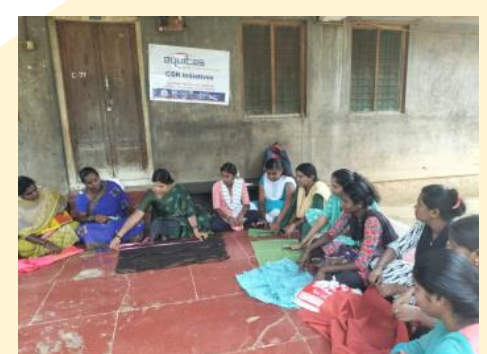
Blouse Cutting Training @ Mandya