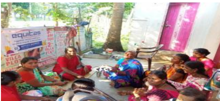
Agarbatti Making @Chennai

WOMEN EMPOWERMENT Providing skill development training to women from economically disadvantaged backgrounds empowers them to generate income, either as their primary source or as a supplementary income. By producing various items, these women not only fulfill their household needs more affordably but also potentially create a profitable business by selling their creations. In this context, various Skill Development Training programs are conducted PAN-INDIA.