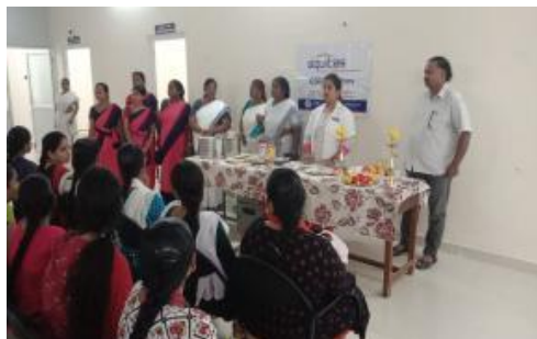
Provided Nutritious Food to 14 Pregnant Women @ Chennai