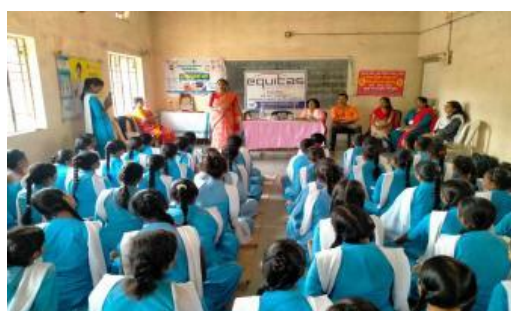
Mental Health, Good Touch - Bad Touch Awareness Program @ Amravati