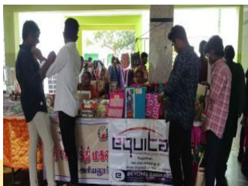
Organised exhibition at Imayam,College & Rover Colleges, Perambalur. No of Stalls: 18, Total Sale Value : Rs.63,190