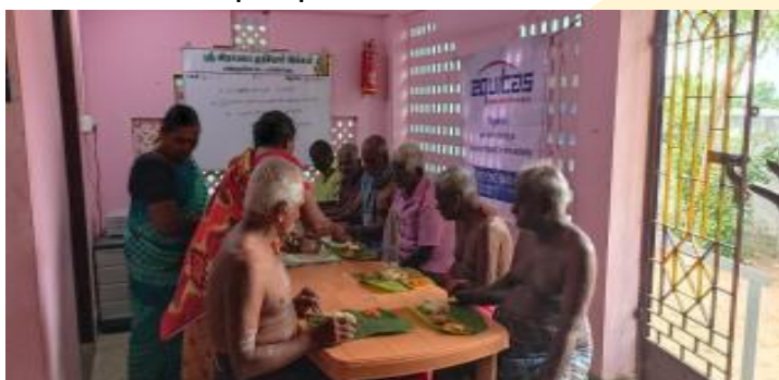
Provided morning breakfast to 20 Old aged people @ Kumbakonam