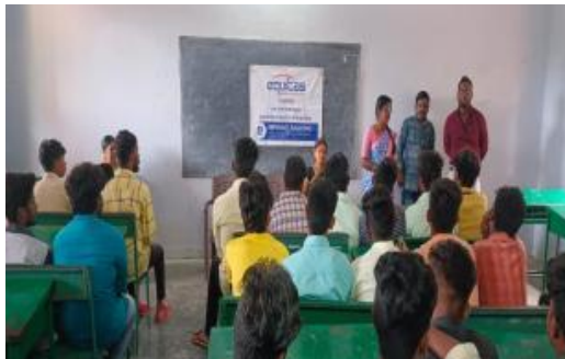
Cancer awareness Program @ Dindugal