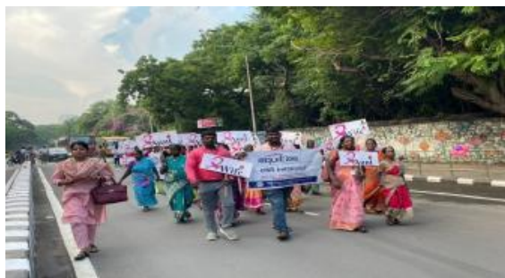
CSR Team took active participation in the walkathon organized by CAN – STOP , at Chennai for creating awareness about preventing Breast Cancer