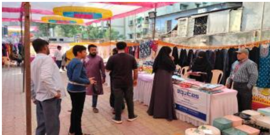
Diwali Exhibition @ Ahmedabad No. of Stalls: 13, Total Sale Value : Rs. 82,000