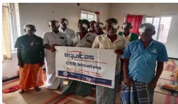
Cataract surgeries done for 28 Members @ Trichy Amount Saved : Rs.84,000/-

The Equitas Health Helpline is an initiative dedicated to assisting individuals seeking Inpatient (IP) and specialized health treatments. A toll-free number is made available to our members and beneficiaries, offering guidance to our affiliated hospitals. This service aids them in accessing their treatments at a subsidized cost.