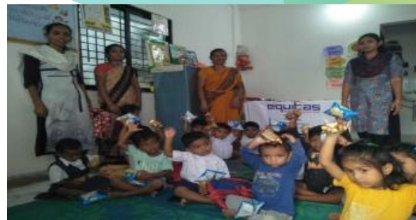
Provided Snacks & Fruits worth of Rs 6000 to 25 Children in an Anganwaadi @ Nagpur