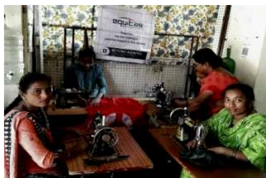
Tailoring Class @Chitradurga