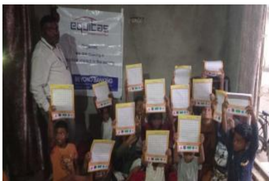
Provided Books worth of Rs 1000 for 40 slum Children @ Jabalpur