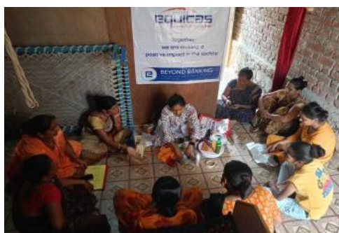
Cake Making Training @Nashik