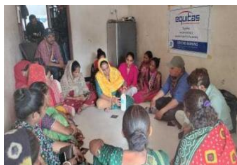
Washing Power Making Training @Ahmedabad