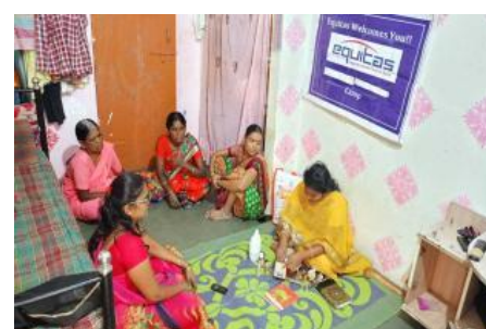
Perfume Making Training @Kolhapur

No of Women Entrepreneurs attended EGK Skill Trainings : 2799