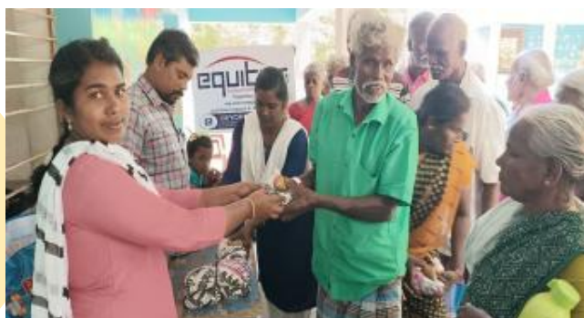
Provided morning breakfast to 40 Old aged people @ Perambalur