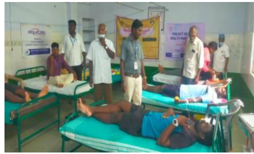
Blood donation camp @ Pondicherry Units Donated : 38