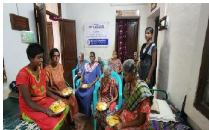
Provided morning breakfast to 25 Old aged people @ Tirunelveli