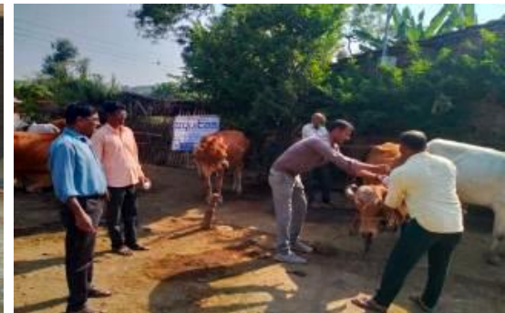
Veterinary Camp @ Amravati