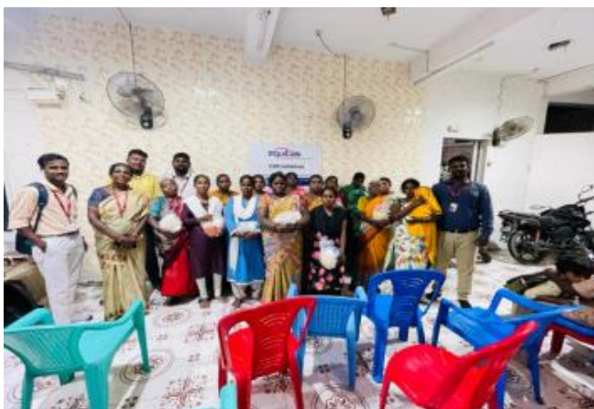
Provided Groceries to 20 Rehabilitated Pavement Dweller Families @ Chennai