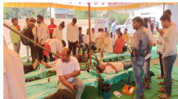
Mega Blood Donation Camp @Kholapur Units Donated : 165