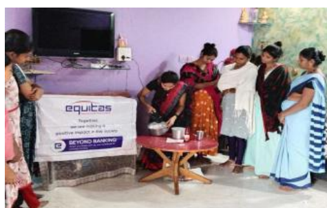
Cake Making Training @Aurangabad