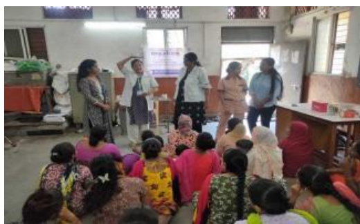
Breast Cancer And Antenatal Check Up Awareness Program @ Pune