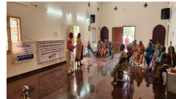
Cancer Awareness Program@ Tirunelveli