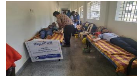
Blood Donation Camp @ Mysore Units Donated: 70