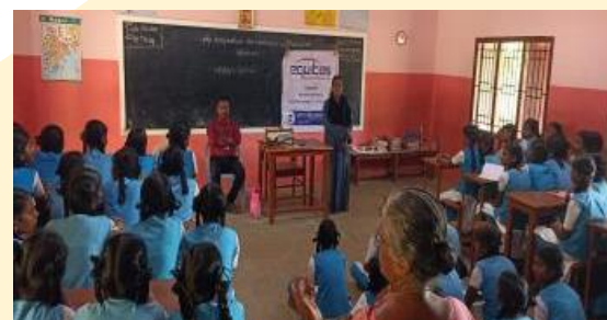
Mental Health awareness program for Adolescents @ Kumbakonam