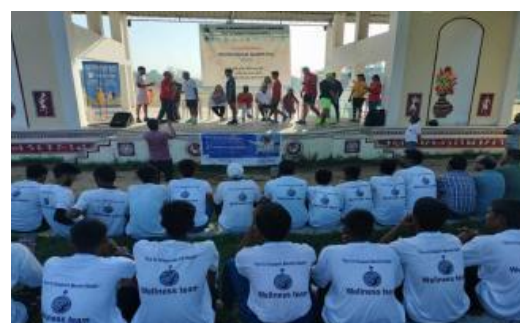
Run to Support Mental Health Awareness Program @ Udaipur