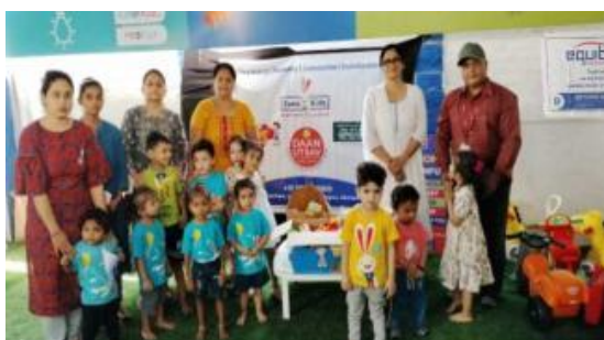
Provided Toys worth of Rs 2800 to 18 Children @ Ahmedabad