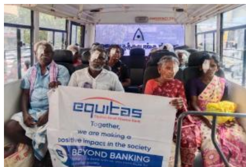
Cataract surgeries done for 41 Members @Perambalur Amount Saved : Rs.1,23,000/-