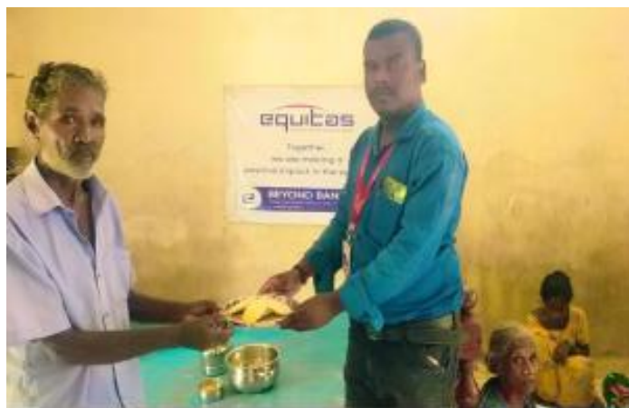
Provided morning breakfast to 17 Old aged people @ Pondicherry