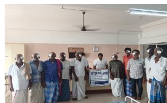
Cataract surgeries done for 23 Members @Tirchengode Amount Saved : Rs.69,000/-