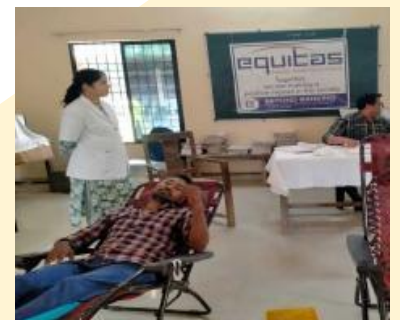
Blood Donation Camp @Amravati Units Donated : 30