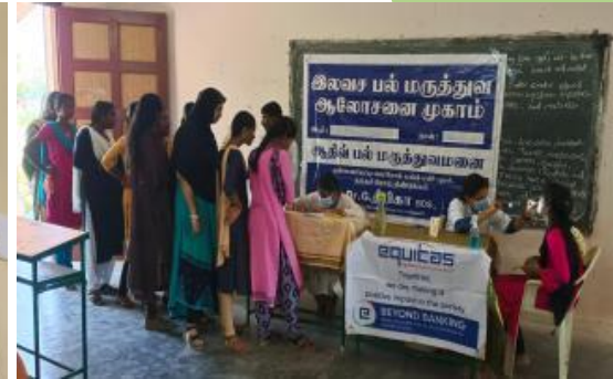
Dental Camp @ Dindugal