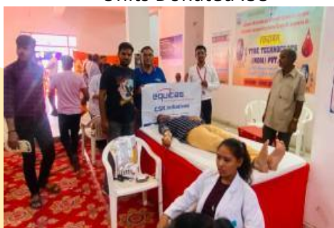
Blood donation camp @Udaipur Units Donated : 32