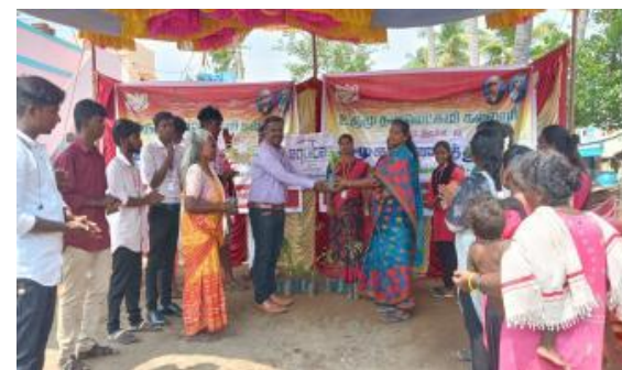
Planted 100 trees at Dhanalakshmi college@ Trichy