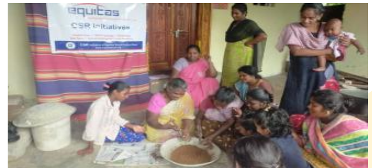
Chemical Making @ Pondicherry