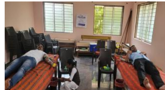
Blood donation camp @Dindugal Units Donated :38