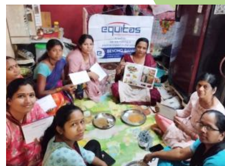
Masala Making Training @Pune