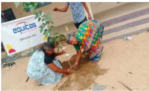
Planted 50 trees at Govt.Hr.sec. School, Ranipet @Vellore