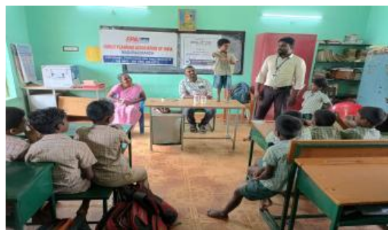
“Wash hands the Right Way”- Hygiene awareness program for children @Madurai