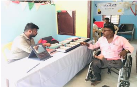
Eye Camp for the specially abled people @ Chennai