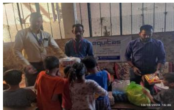
Provided Fruits & Toys worth of Rs 4000 to 25 inmates of Surman Sansthan @ Jaipur