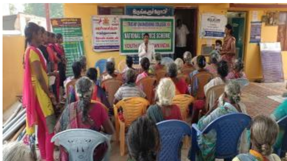
Cancer awareness Program @ Perambalur