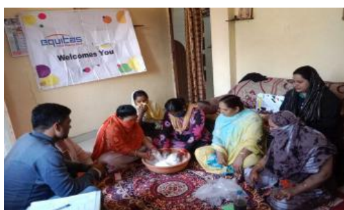
Chemical Making Training @Raipur