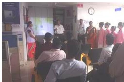
Awareness on CPR Program for ESFB staff @ Jabalpur