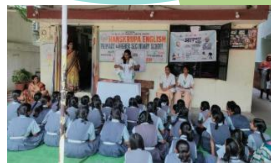
Menstrual Cycle Awareness Program @ Nagpur