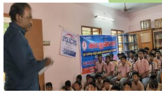
De Addiction awareness program for Children @ Trichy