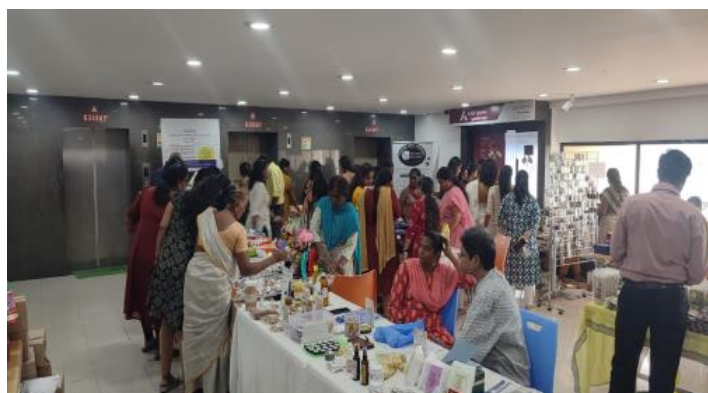
Organised exhibition at H.O , Chennai. No of Stalls : 15 , Total Sale Value : Rs.1,31,115