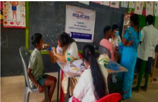
Dental Camp @ Pondicherry