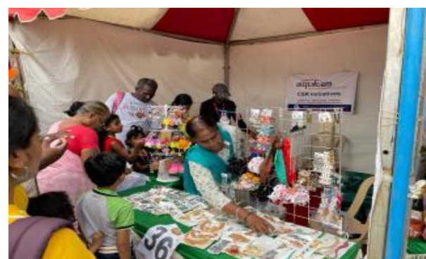
Organized exhibition at St. Patrick'S Anglo-Indian Hr. Sec. School @ Chennai. No Of Stalls : 4 , Total Sale Value : Rs.21,525