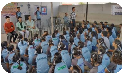
Drug & HIV-AIDS Awareness Program @ Ahmedabad