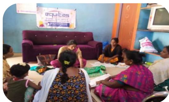
Chudithar Cutting @Chennai

Providing skill development training to women from economically disadvantaged backgrounds empowers them to generate income, either as their primary source or as a supplementary income. By producing various items, these women not only fulfill their household needs more affordably but also potentially create a profitable business by selling their creations. In this context, various Skill Development Training programs are conducted PAN-INDIA.