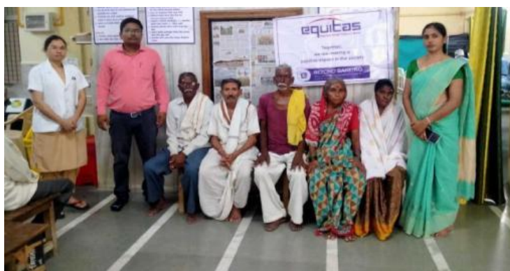
Cataract Surgery done for 10 Members @ Nagpur Amount Saved Rs. 50,000