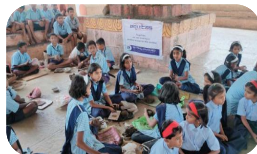
Ganesh Idol Making Training @ Pune