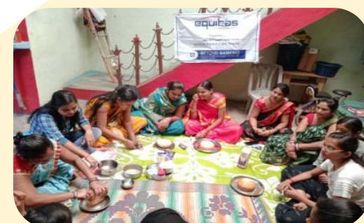
Cake Making Training @ Raipur