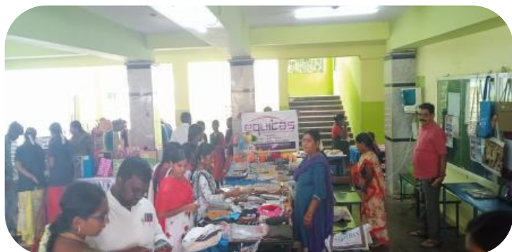
Organised exhibition @Perambalur. No Of Stalls:9, Total Sale Value : Rs.34,756