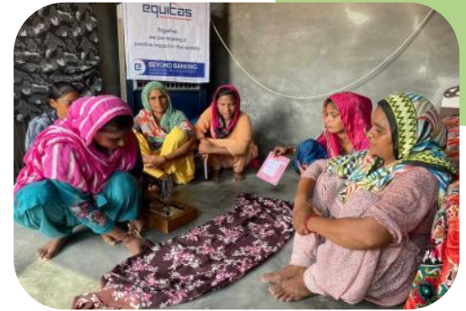
Tailoring Training @ Punjab