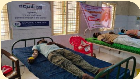
Blood Donation Camp @ Pondicherry