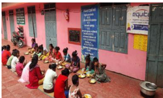
Provided Break fast for 20 inmates of Arun Rainbow Children home @Chennai