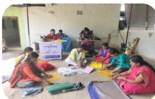
Chudithar Cutting @Mysore