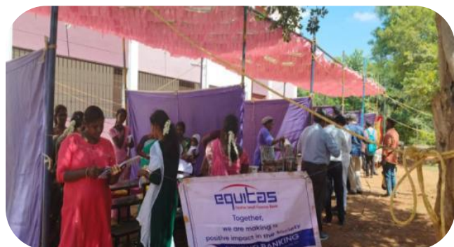
Organised exhibition @ Trichy. No Of Stalls 8, Total Sale Value : Rs.23489