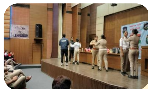
Self Defence Awareness Program @ Ahmedabad