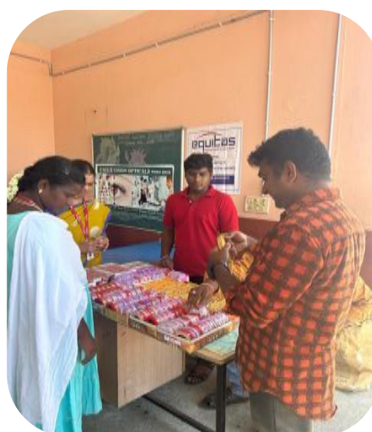
Organised stall activity @Dindugal. No Of Stalls 2, Total value is Rs 4130