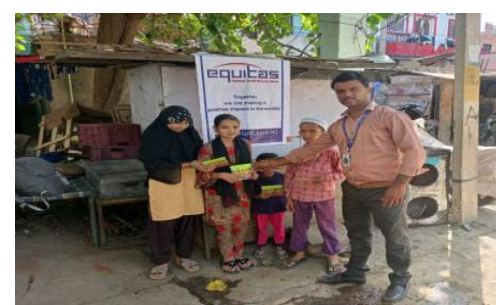
Provided Gift like Colour Pencil, Kids Shoe & Sweater 40 to Children @ Jodhpur. Value of Rs.1000/-