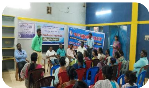
De addiction and career guidance Awareness program @Trichy