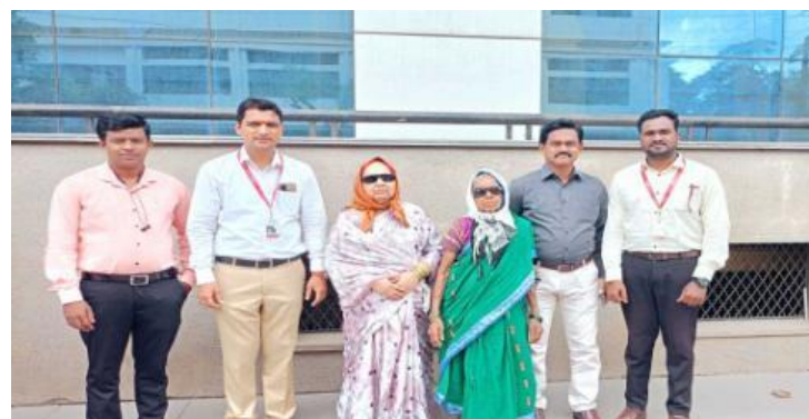
Cataract Surgery done for 2 Members @ Kolhapur. Amount Saved Rs. 10,000