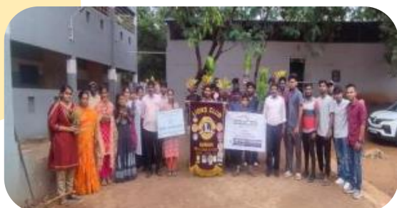
Tree Sapling distribution @Coimbatore