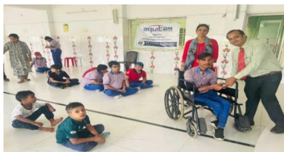
Provided Stationaries like Note Books, Pen, Pencil, Colour box, Story Books worth of Rs3800 to 48 Children living in Jyoti Home Special School of Disability.