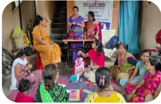
Ganesh Peta Making Training @ Kolhapur