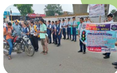
Traffic Awareness Program @ Ahmedabad