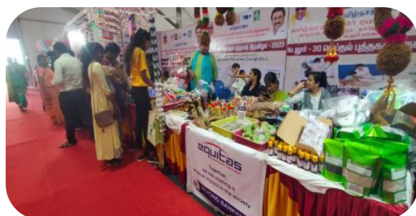
Organised exhibition @Cudalore. No Of Stalls: 8, Total Sale Value : Rs.28950