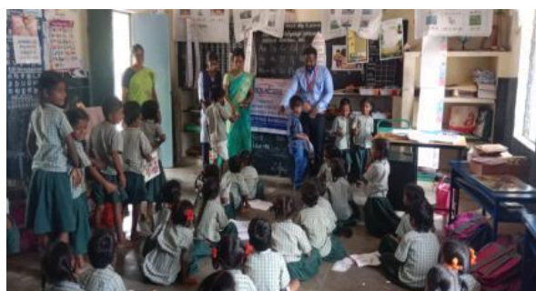
Provided School Bag, Note Books & Water Bottle for 40 Children @ Trichy