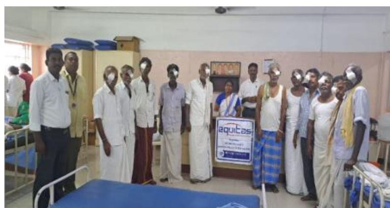
Cataract surgeries done for 63 Members @Tiruchengode Amount Saved : Rs.189000/-