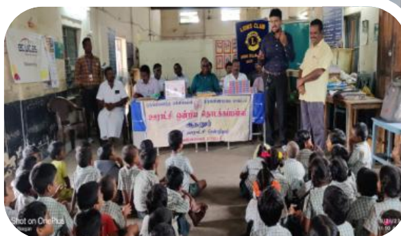
Oral Care Awareness program @Vellore