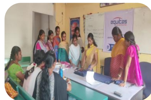
Chudithar Cutting @Erode