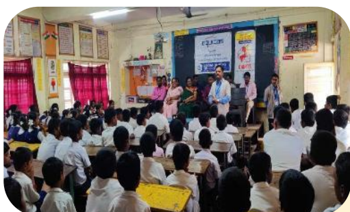
Financial Literacy Awareness Program @ Kolhapur