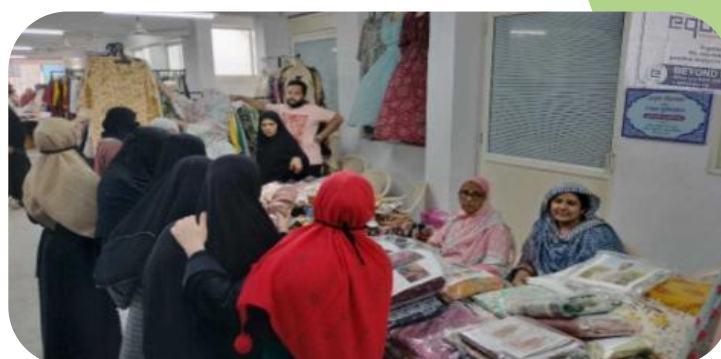
Organised stall activity @ Ahmedabad, No of Stalls: 3 Total Sale Value: 29,000