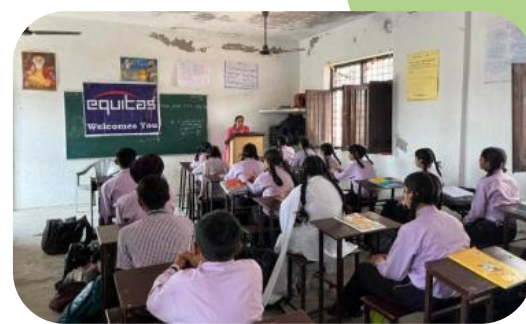
Oral Care Awareness Program @ Punjab