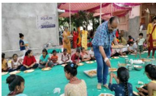
Provided Lunch worth of Rs 14,000 for 500 Children in Rakhiyal Area @ Ahmedabad.