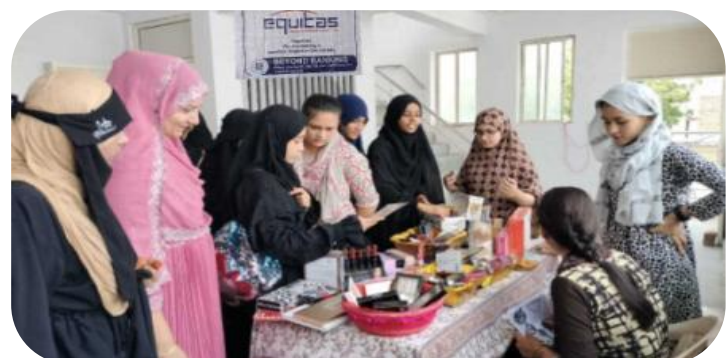
Organised stall activity @Ahmedabad, No of Stalls: 1 Total Sale Value: 12,000