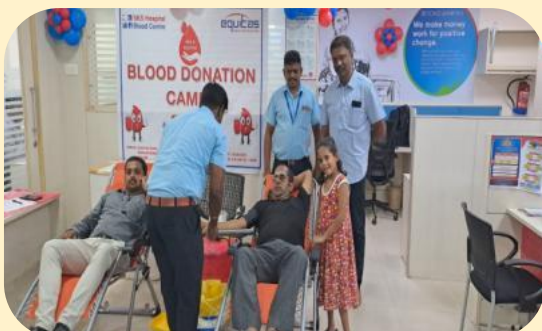
Blood Donation Camp @ Salem