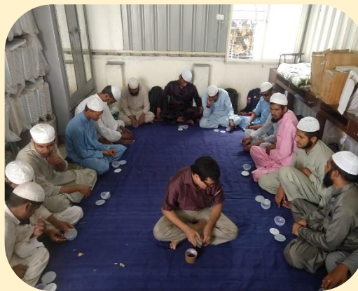
Visually Impaired Empowerment – Training, Pune