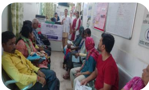
Dengue Fever Awareness Program @ Nagpur