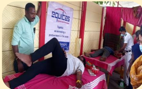
Blood Donation Camp @ Kumbakonam