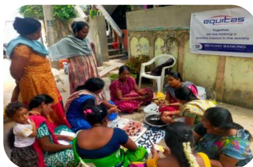
Chemical Making @ Pondicherry