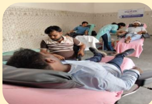
Blood Donation Camp @ Haryana