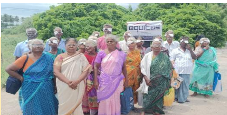
Cataract surgeries done for 45 Members @Perambalur Amount Saved : Rs.135000/-