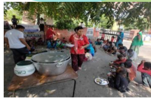
Provided Lunch worth of Rs 1,500 provided for 50 Children in Rhotak Area @Haryana