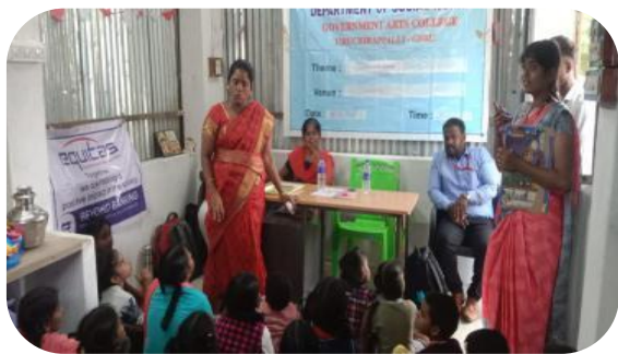
Child and Women Protection awareness program @ Trichy