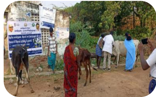
Veterinary Camp @ Kumbakonam