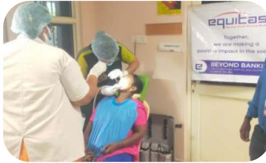
Dental Camp @ Pondicherry