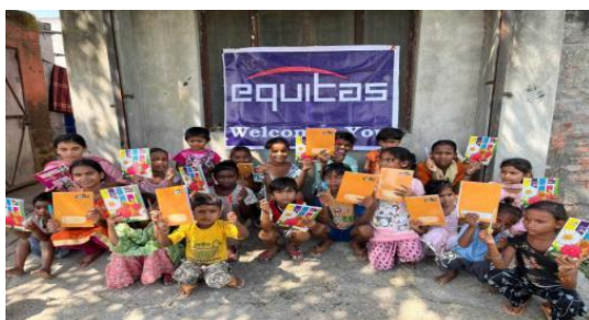
Provided Stationary like Note Books, Pen & Pencil worth of Rs2000 to 40 Children in Slum area @ Punjab.