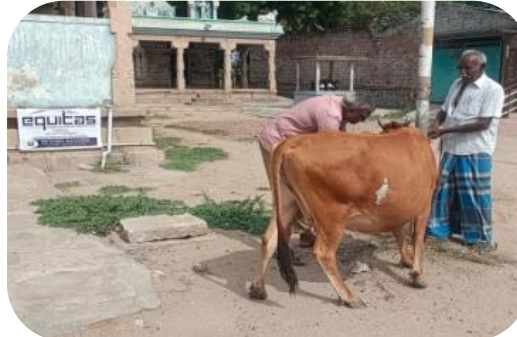
Veterinary Camp @ Perambalur