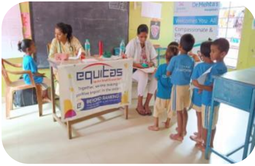
Dental Camp @ Chennai