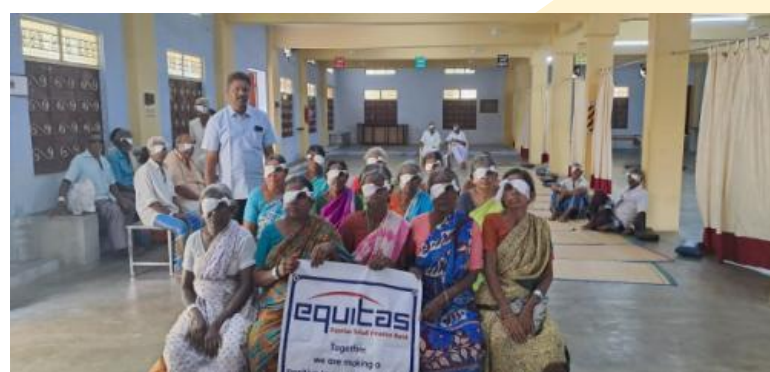
Cataract surgeries done for 25Members @Salem Amount Saved : Rs.75000/-