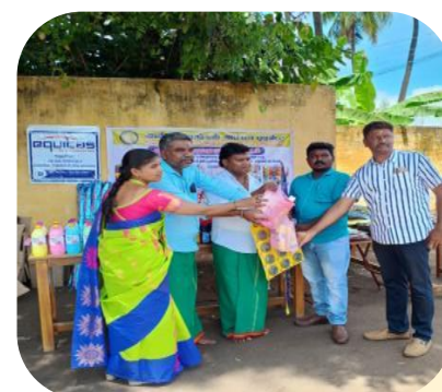
Organised stall activity @ Salem. No Of Stalls 3, Total value is Rs 14000