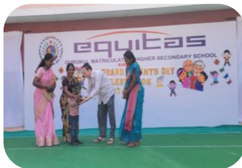
World Grandparent Day Celebration @ Gurukul school, Karur