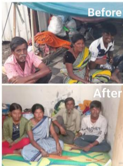
Families shifted from Ganga Dham to Bebwewadi Pune