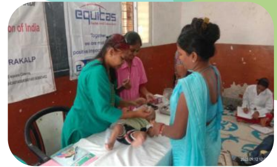
Pediatric Camp @ Pune