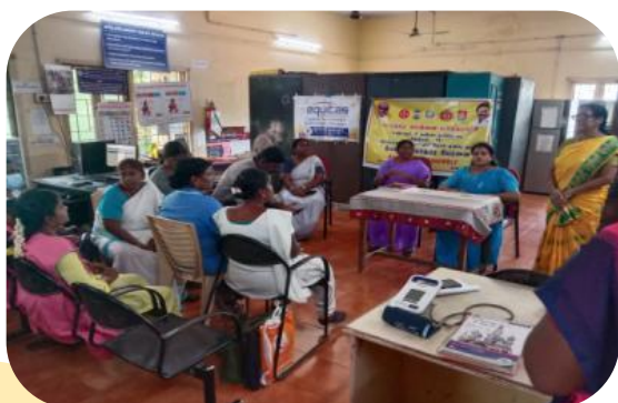
Communicable Diseases Awareness Program@ Chennai