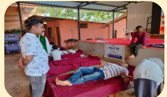
Blood Donation Camp @ Hubli