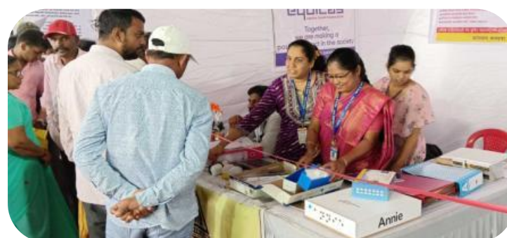
7 visually impaired person given training for making LED lights & Solar products, participated and exhibited their products @ Nashik, No of Stalls: 7 Total Sale Value: 15,000