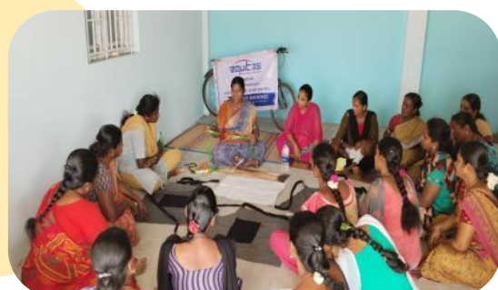
Blouse Cutting @Trichy