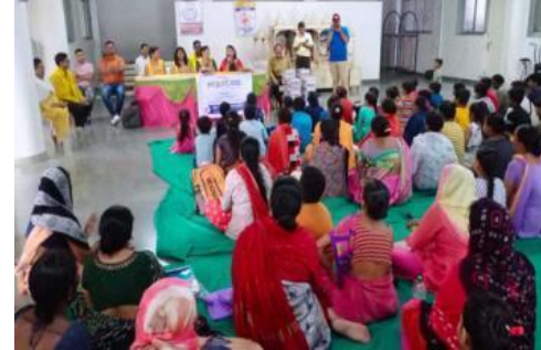
Provided School Bag, Note Books & Water Bottle worth of Rs.22,000 to 72 children affected by HIV AIDS @ Ahmedabad.