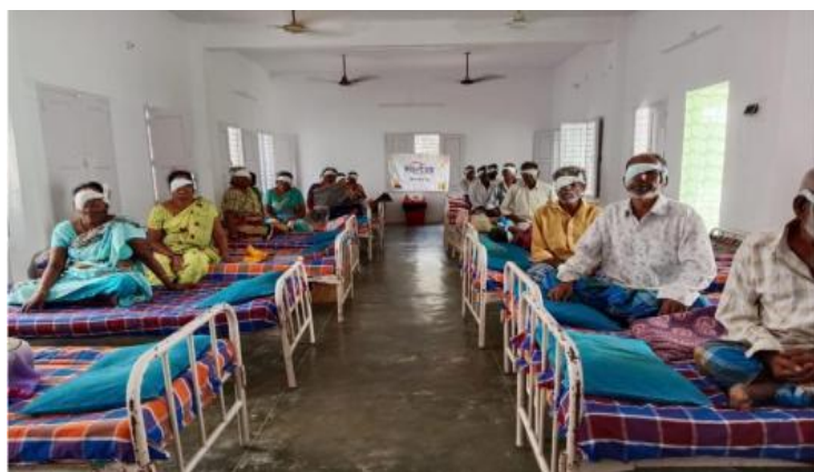
Cataract surgeries done for 20 Members @Vellore Amount Saved : Rs.60000/-