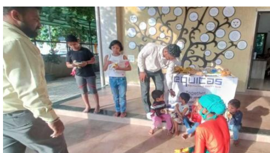
Provided Grocery and Fruits worth of Rs 3000 to 25 Children living in Snehankur Orphanage Home @ Aurangabad.