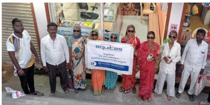
Cataract Surgery done for 8 Members @ Pune. Amount Saved Rs. 40,000

The Equitas Health Helpline is an initiative dedicated to assisting individuals seeking Inpatient (IP) and specialized health treatments. A toll-free number is made available to our members and beneficiaries, offering guidance to our affiliated hospitals. This service aids them in accessing their treatments at a subsidized cost.