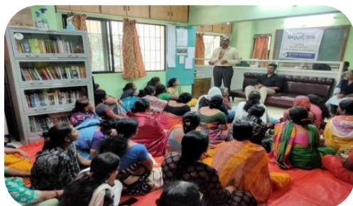
Cervical Cancer and Breast Cancer Awareness Program @ Pune