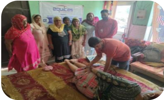
Physiotherapy Camp @ Haryana