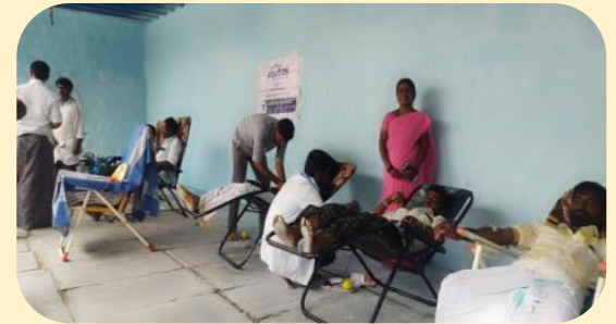
Blood Donation Camp @ Chitradurga