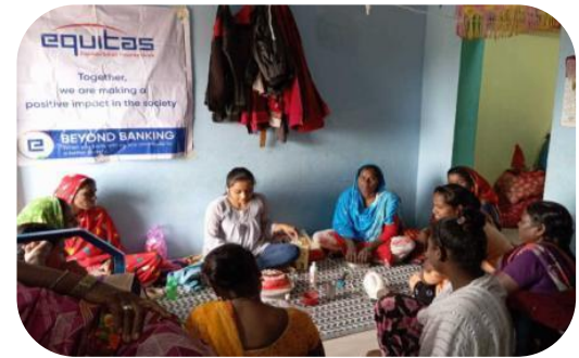
Cake Making Training @ Nashik

No of Women Entrepreneurs attended EGK Skill Trainings 3665