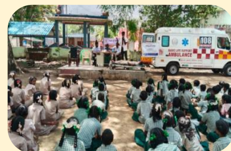
First Aid Awareness Program @Pondicherry