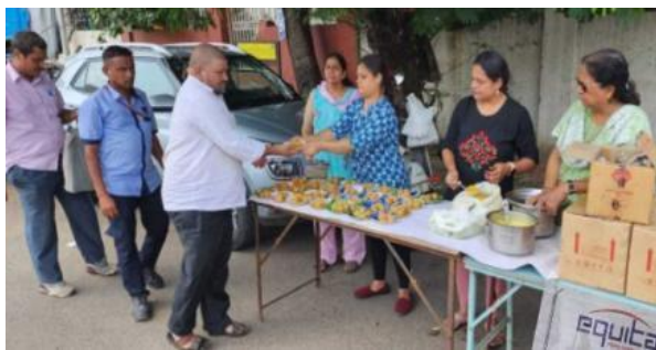
Provided Snacks worth of Rs9,000 for 137 Members in Wadaj Area @ Ahmedabad.