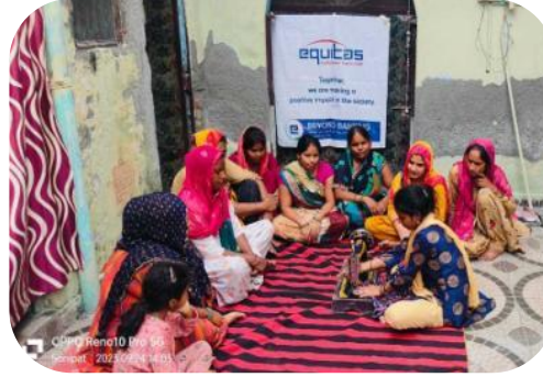
Tailoring Training @ Haryana