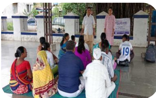
Cancer Awareness Program @ Nashik