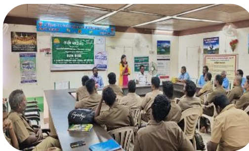
Positive Mental Health Awareness program @Trichy